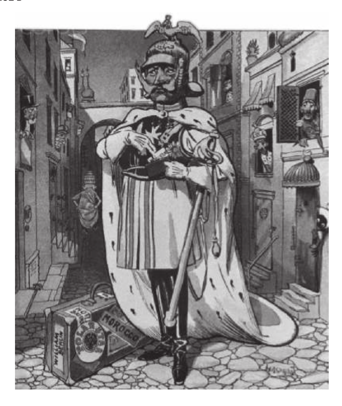
A British cartoon published in 1905. The caption to this cartoon read 'The Morocco Crisis: Let men see - whom shall I call on next?'