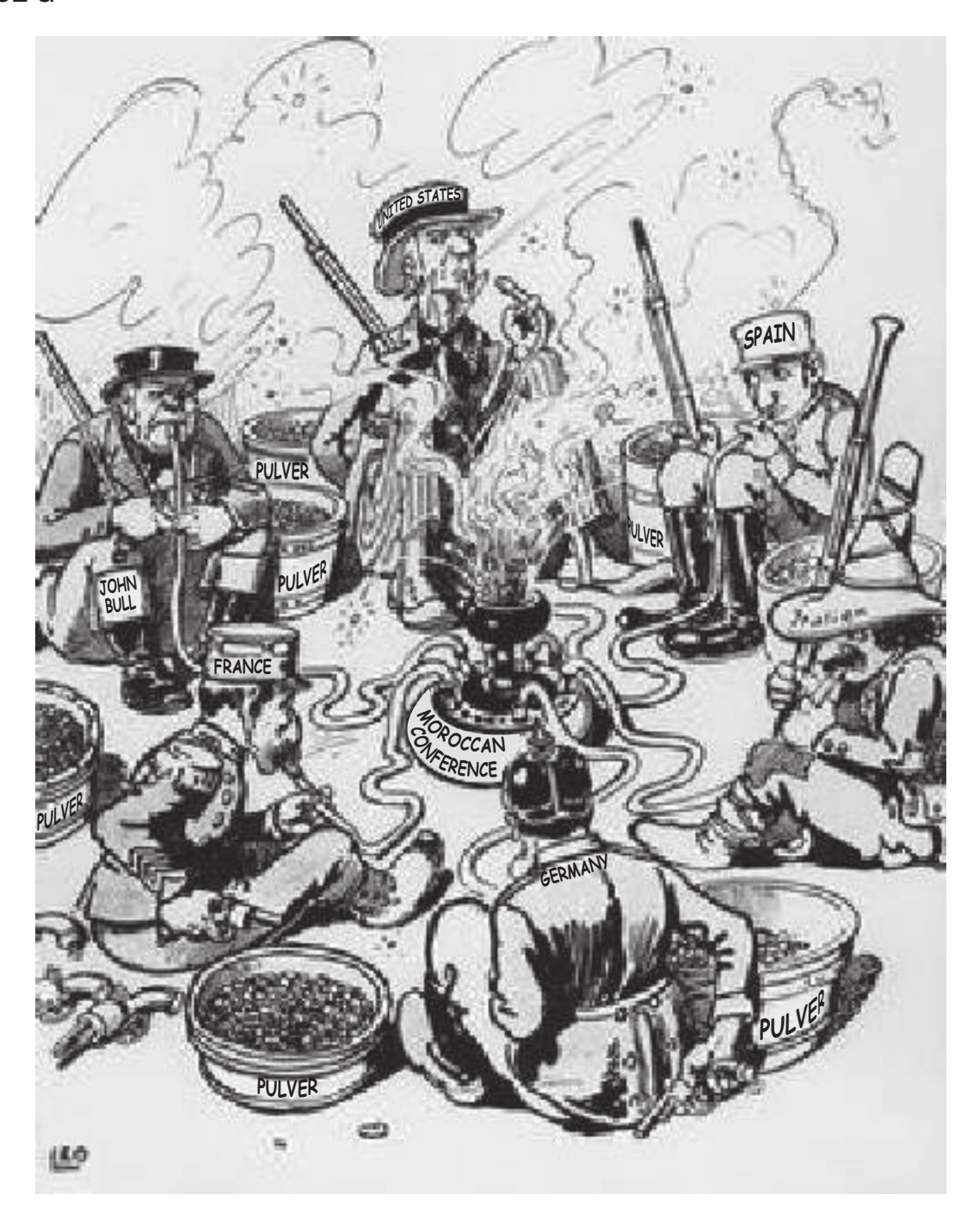
A German cartoon published in February 1906. The caption to the cartoon read 'At the Moroccan Conference: enthusiasm for smoking the peace pipe does not exclude the danger of a general explosion.' Pulver means gunpowder.