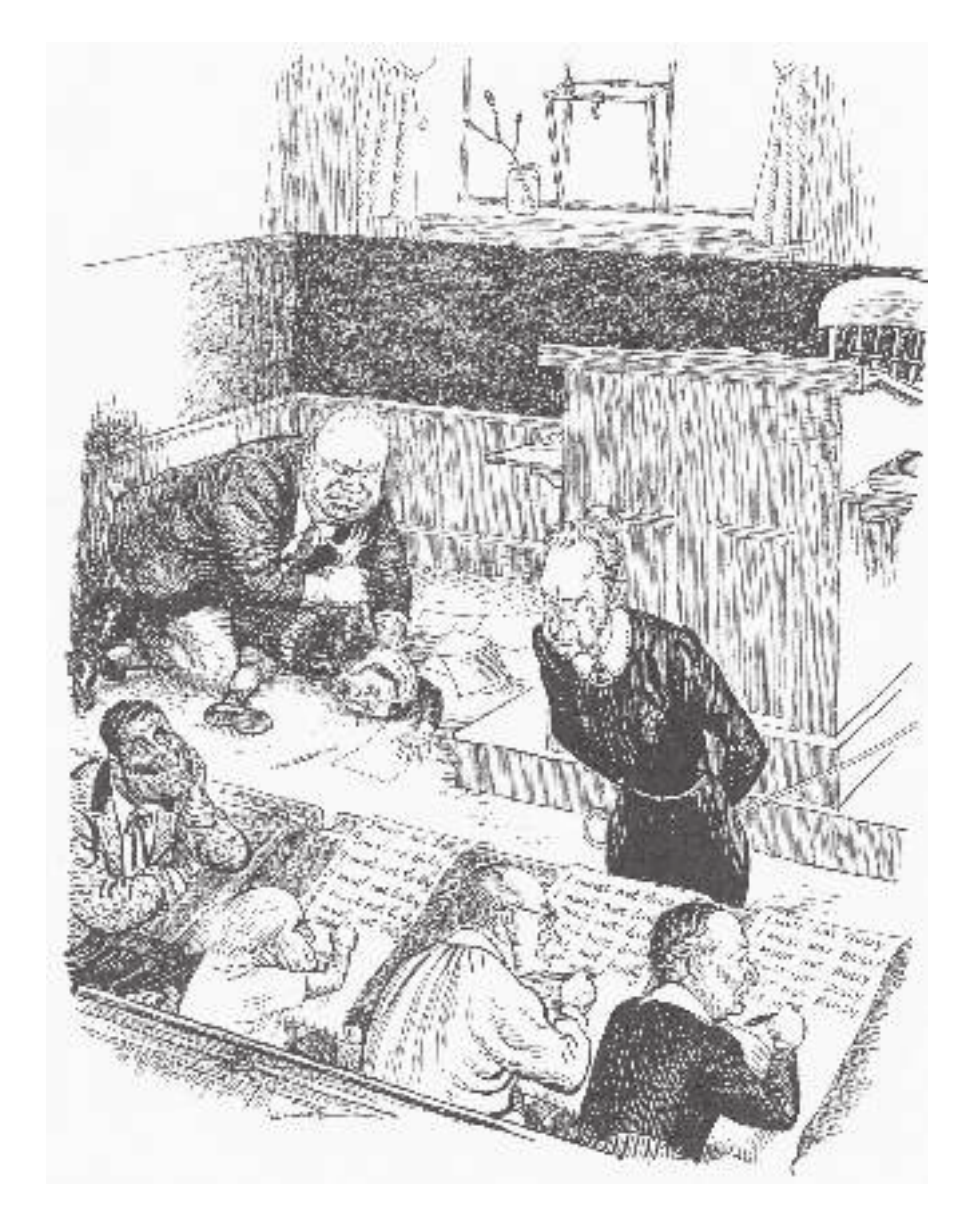
A cartoon published in Britain, 28 November 1956. Khrushchev is shown with Hungary on the floor. The figures seated at the desks represent, from the left, President Nasser of Egypt and the governments of Israel, Britain and France. The woman represents the United Nations.