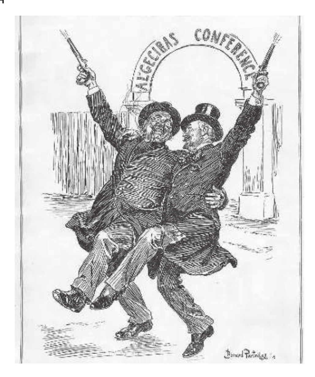
A British cartoon entitled 'Shots of Joy', published in April 1906. The caption to the cartoon read 'The Algeciras Conference has practically been concluded to the mutual satisfaction of the two rival powers whose differences at one time threatened to end in something worse than a diplomatic duel.'