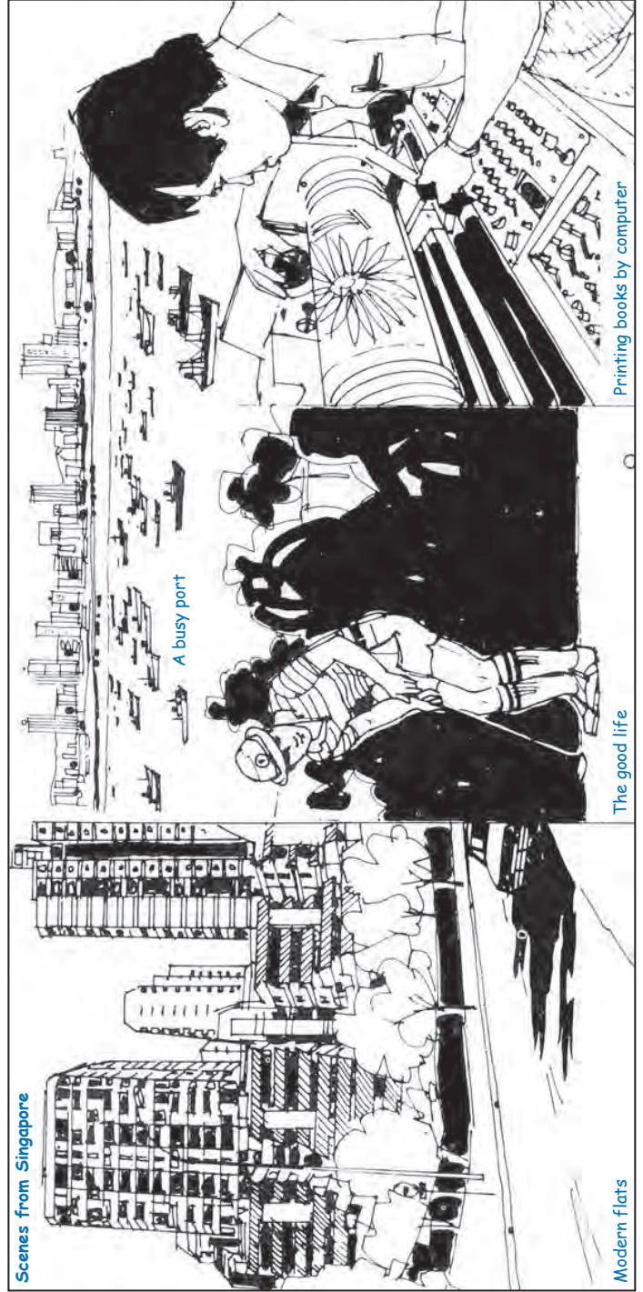
A busy port