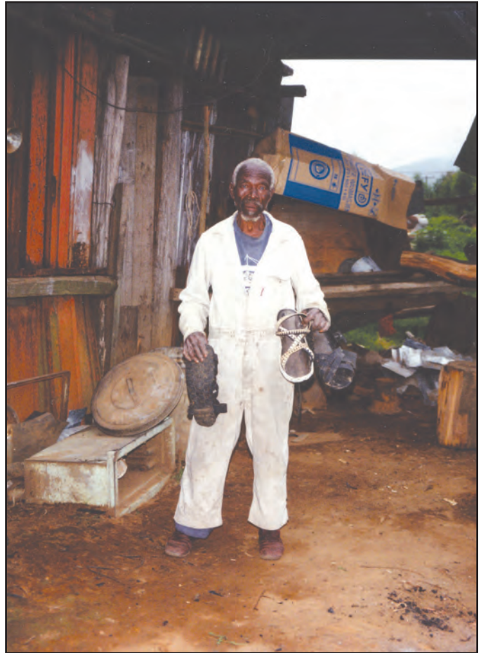
Fig. 4 A photograph which the student has taken.