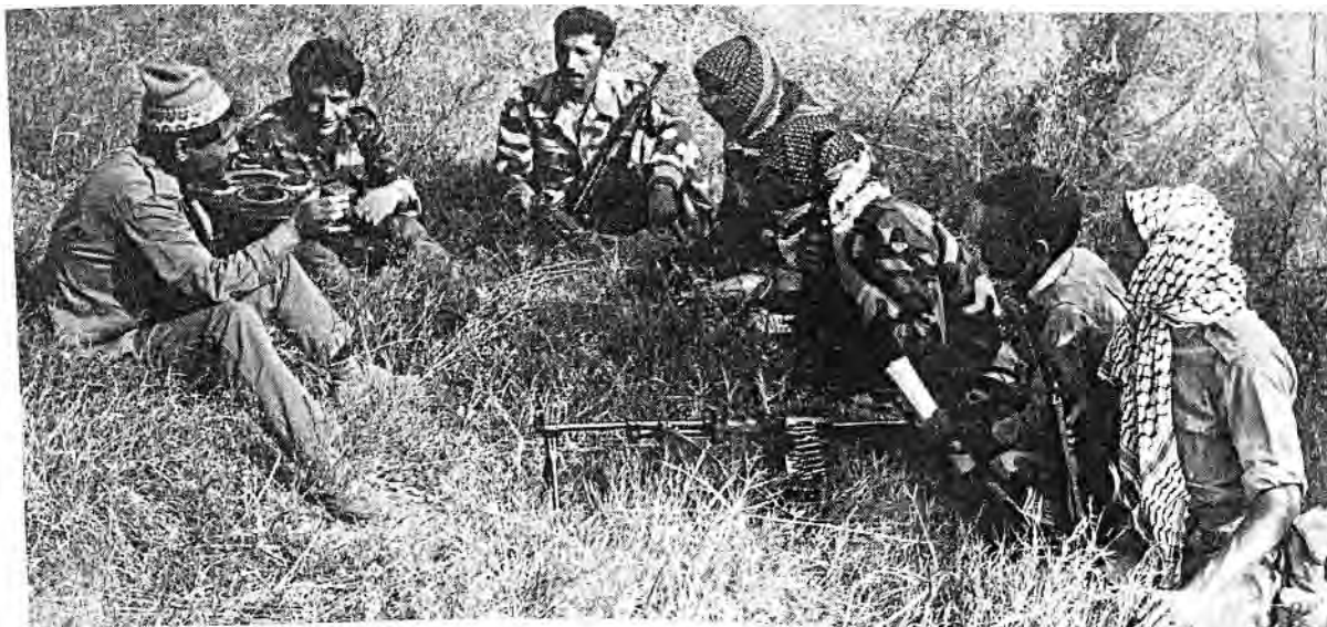
Fedayeen members before an operation against enemy units.

20 Study the photograph, and then answer the questions which follow.