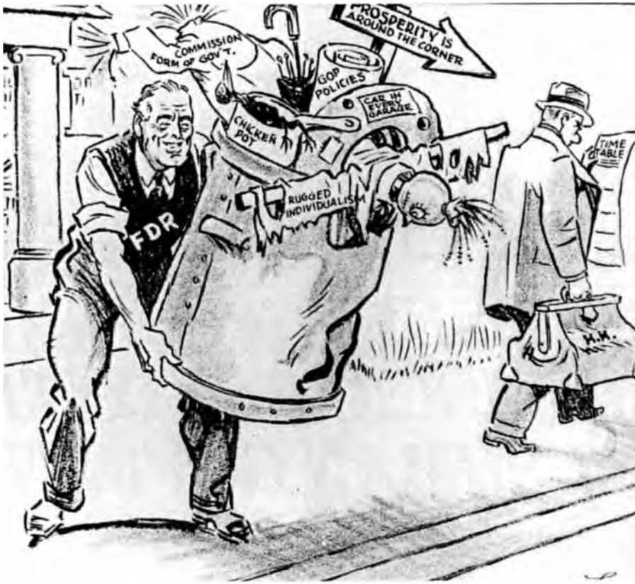
A cartoon about Roosevelt's New Deal.

14 Study the cartoon, and then answer the questions which follow.