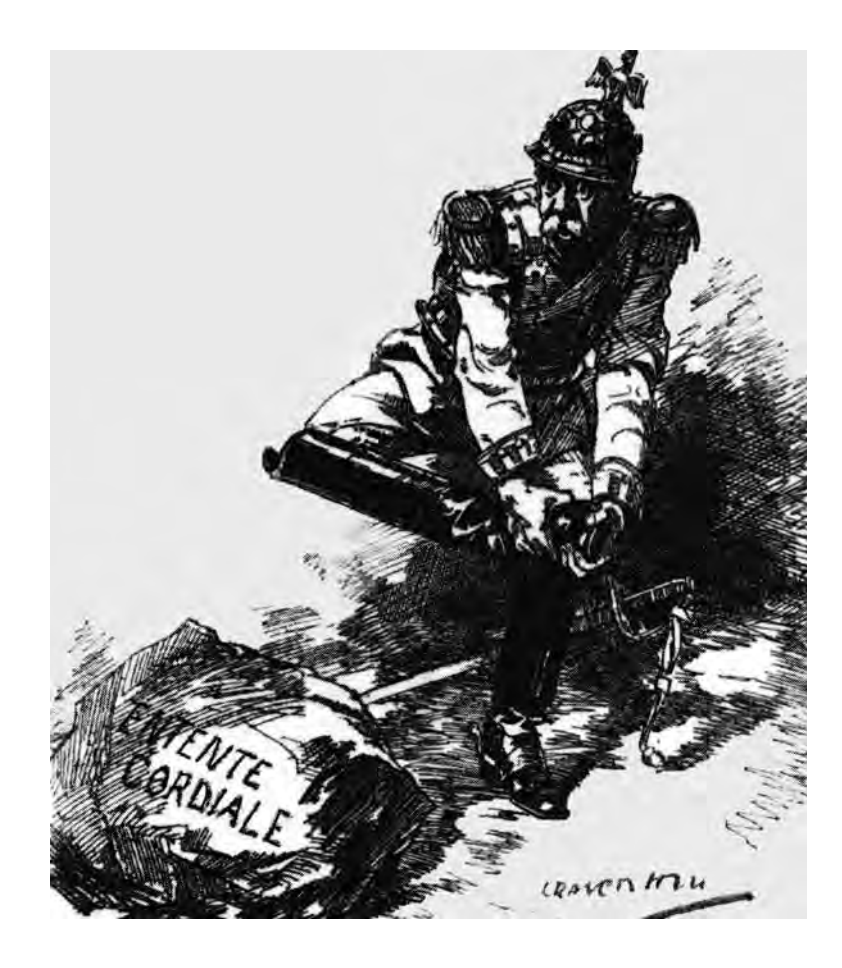
A British cartoon published in August 1911. The figure representing Germany is saying 'It's rock. I thought it was going to be paper.'