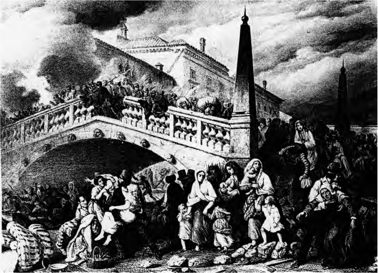
The siege of Venice, 1849