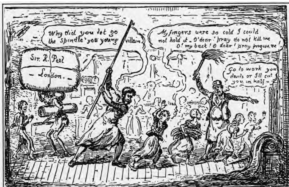
An early nineteenth century cartoon titled 'The Factory Slaves. Their daily employment'.

22 Study the cartoon, and then answer the questions which follow.