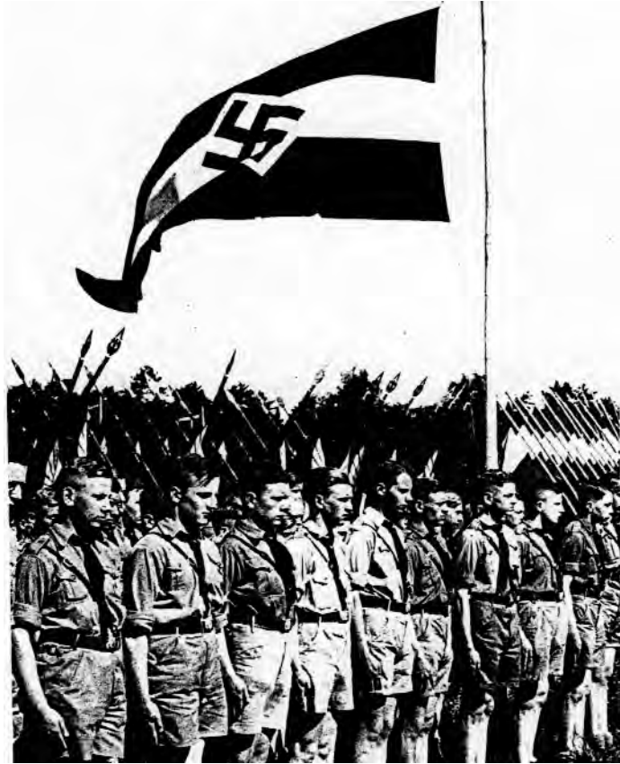
Members of the Hitler Youth on parade.

10 Study the photograph, and then answer the questions which follow.