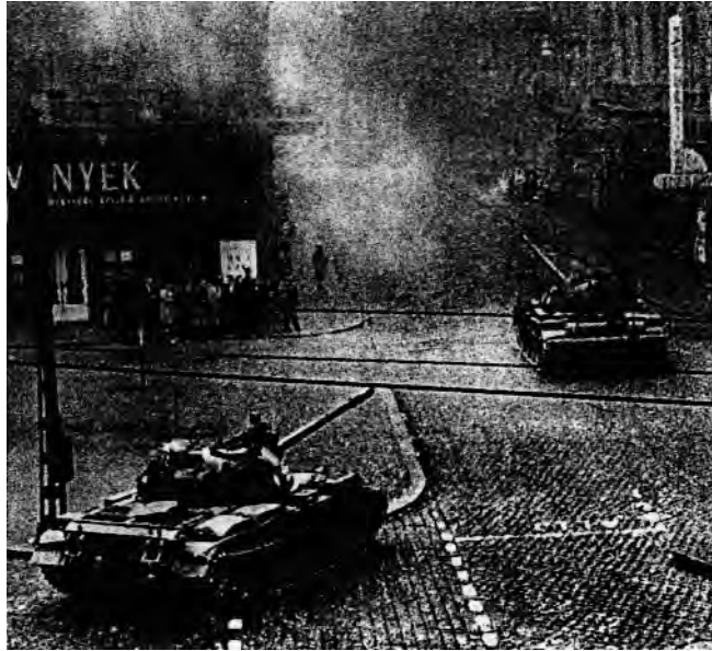
Soviet tanks in Budapest, November 1956.