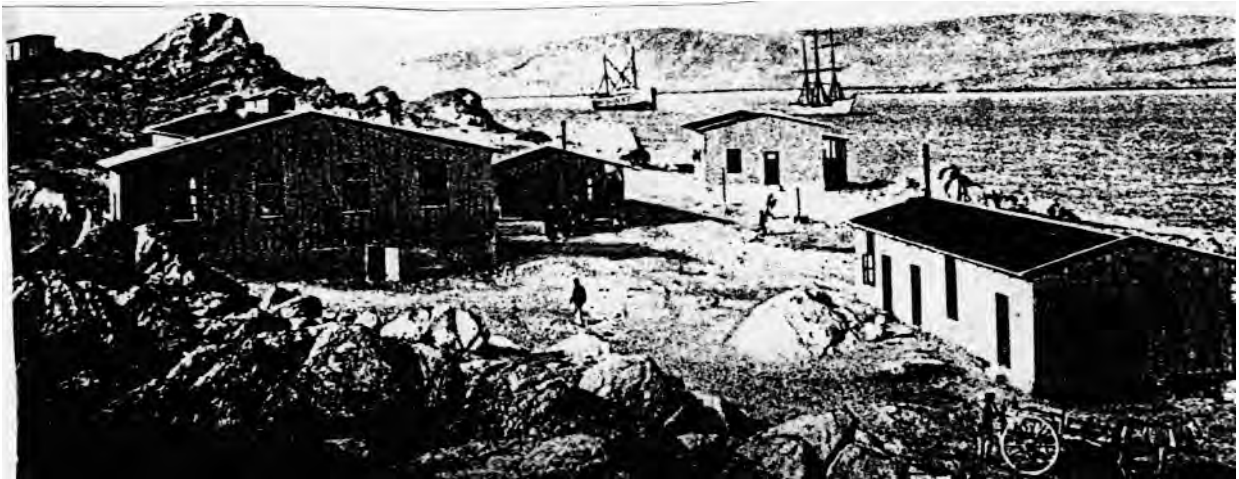
An early German trading post.

19 Study the picture, and then answer the questions which follow.