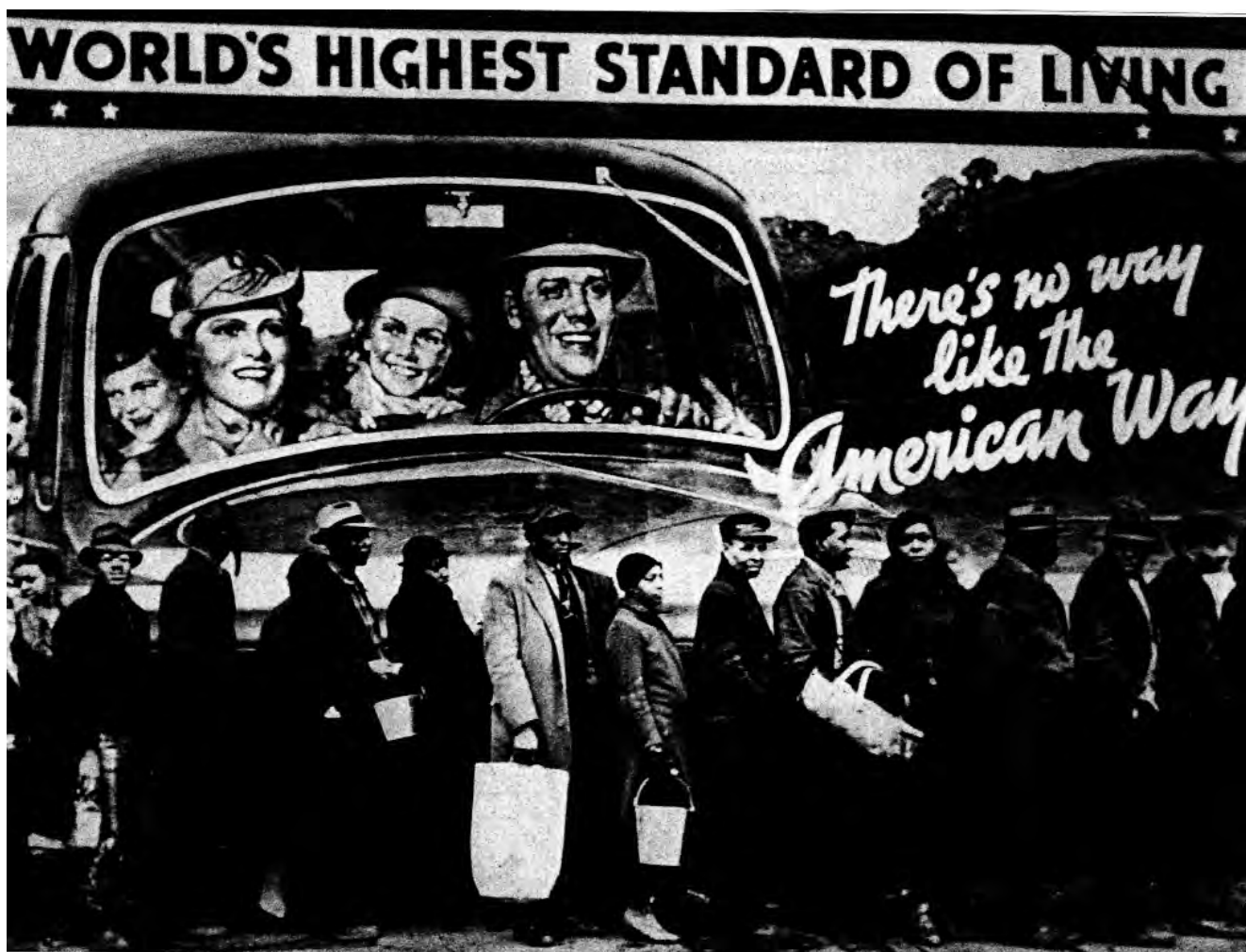
Unemployed people queuing for government relief in 1937.

14 Study the photograph, and then answer the questions which follow.