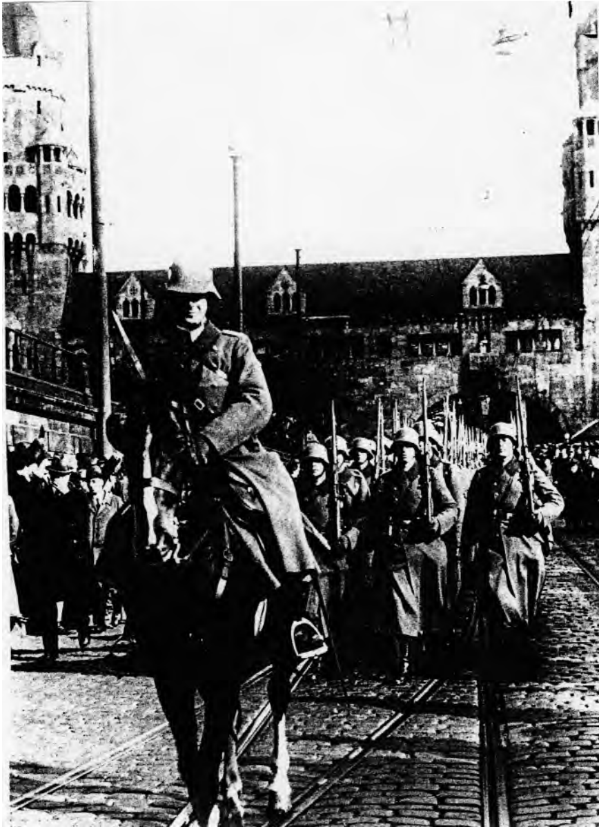
German soldiers entering Cologne in the Rhineland, March 1936.

6 Study the photograph, and then answer the questions which follow.