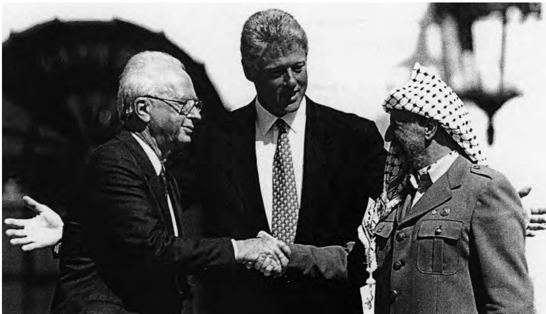
President Clinton with Rabin and Arafat after the signing of the Israeli-PLO peace accord, September 1993.

21 Study the photograph, and then answer the questions which follow.