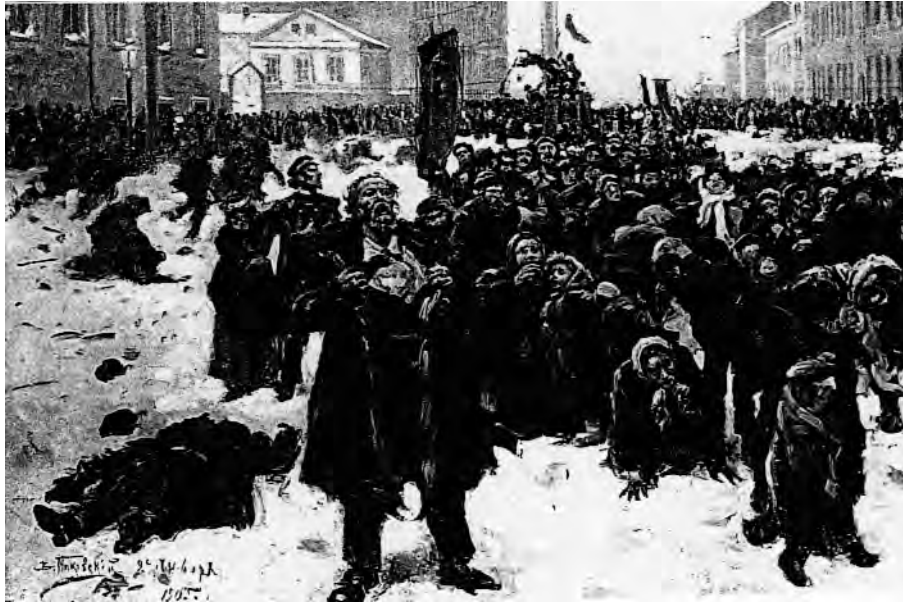
Bloody Sunday – a painting from c.1910.

11 Study the painting, and then answer the questions which follow.