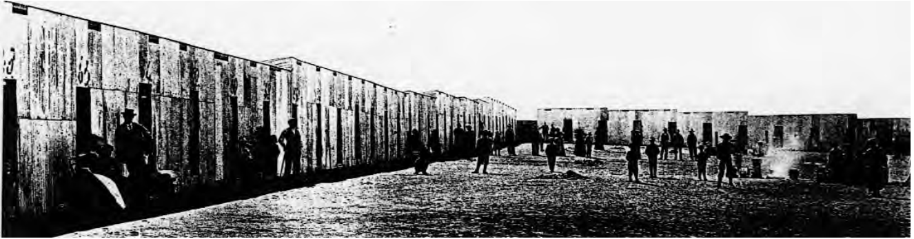
A concentration camp for Boers.

17 Study the photograph, and then answer the questions which follow.