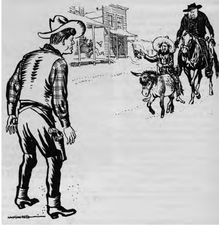
A cartoon published in a British newspaper in October 1962. Kennedy and Khrushchev are shown as gunslingers. Castro is on the donkey.