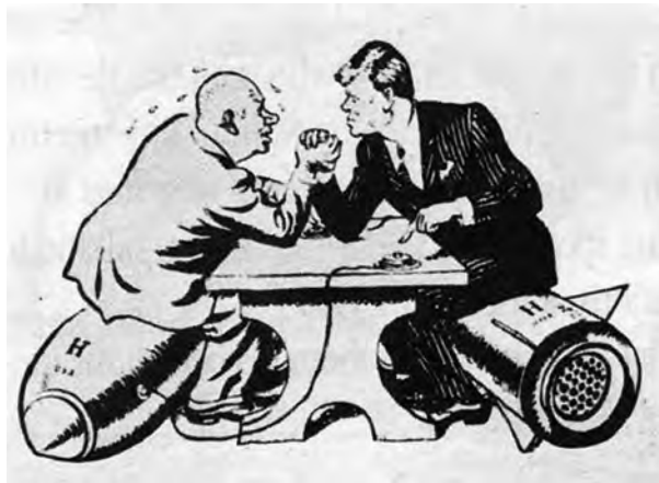
A cartoon published in Britain in 1962.