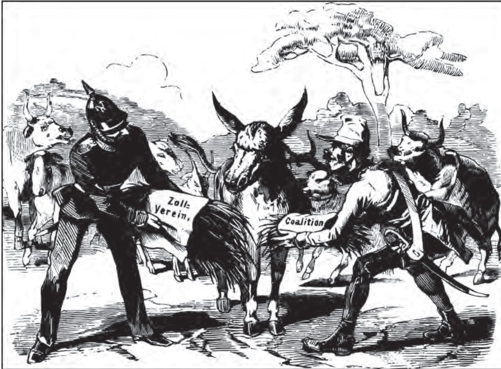
A cartoon from a German magazine published in 1852. The man on the left represents Prussia while the man on the right represents Austria. The animals represent those German states that did not belong to the Zollverein.