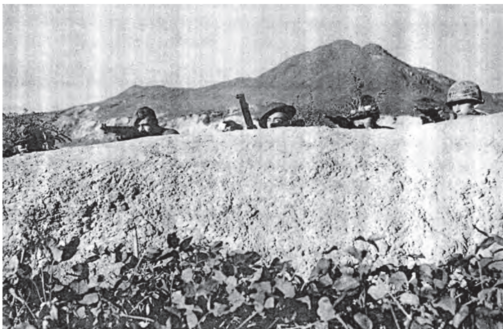
A photograph of UN soldiers in the Korean War. The soldiers include an American, an Australian, an Englishman, and two South Koreans.