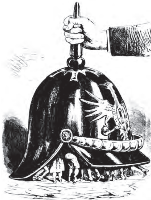
A cartoon published shortly after the Austro-Prussian War in 1866. The helmet represents Prussia while the people represent Germany.