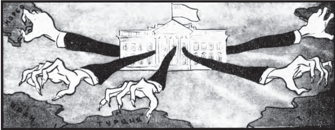
A Soviet cartoon published in 1950. The building represents the White House where the American President lives and works.