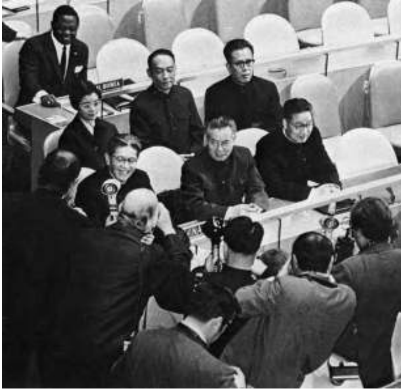
The delegation from the People's Republic of China taking their seats for the first time at the UN, 1971.

15 Study the photograph, and then answer the questions which follow.