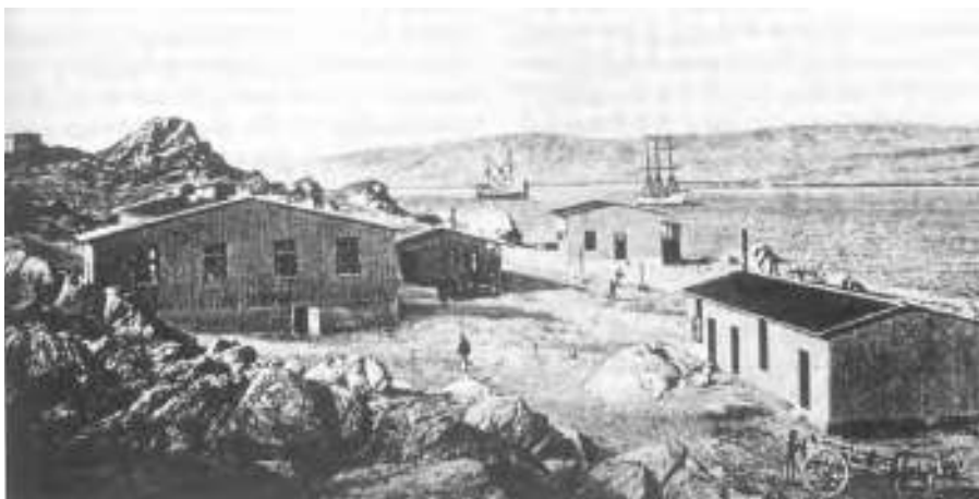
The German trading post at Angra Pequena, Namibia.

19 Study the illustration, and then answer the questions which follow.