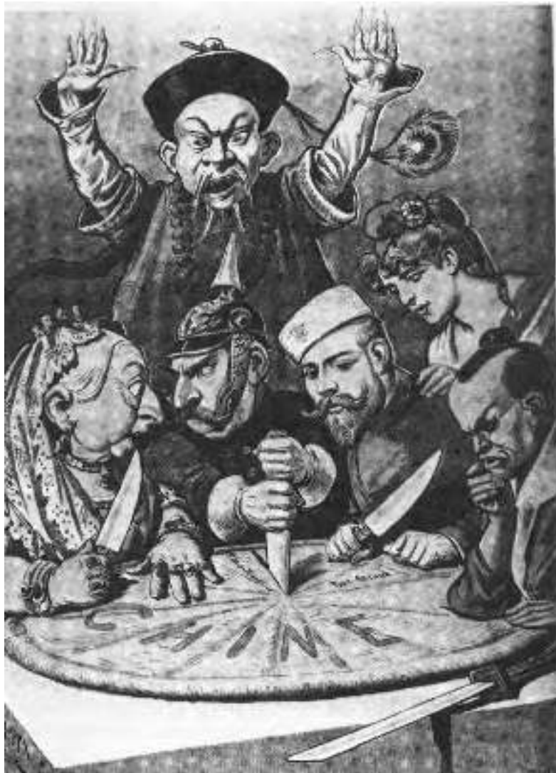
Foreign powers carve up China.

24 Study the cartoon, and then answer the questions which follow.