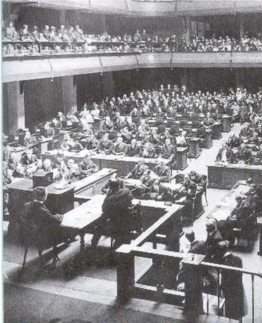
The Assembly of the League of Nations in session, Geneva 1923.

6 Study the picture, and then answer the questions which follow.