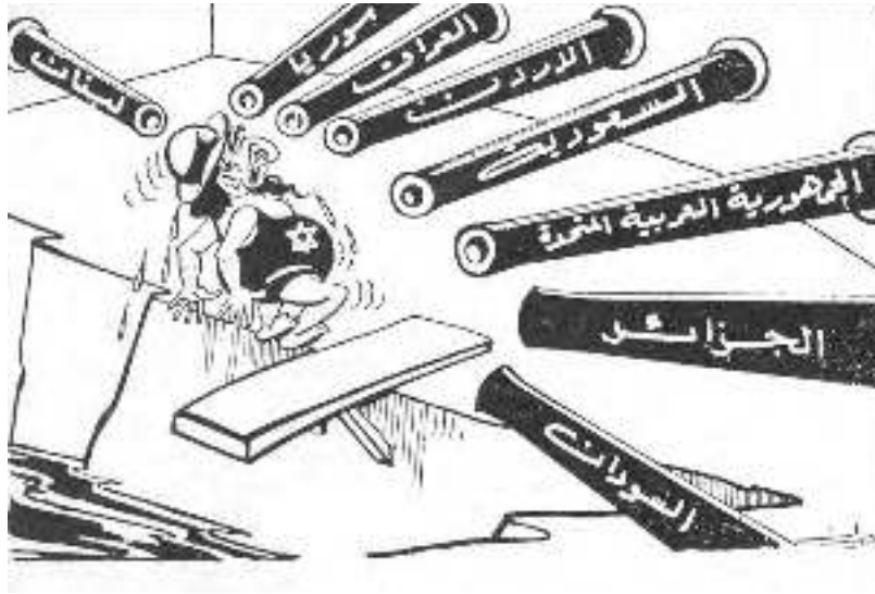
A cartoon published in May 1967 showing Israel facing the armed forces of eight Arab states.

20 Study the cartoon, and then answer the questions which follow.