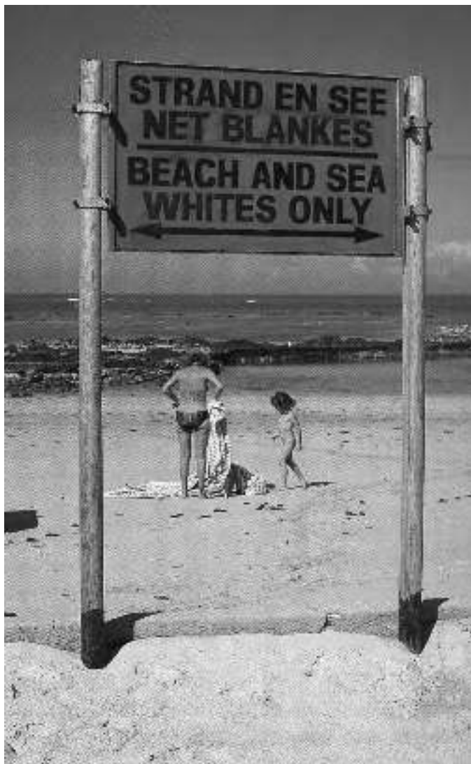
The Separate Amenities Law in action.

18 Study the photograph, and then answer the questions which follow.