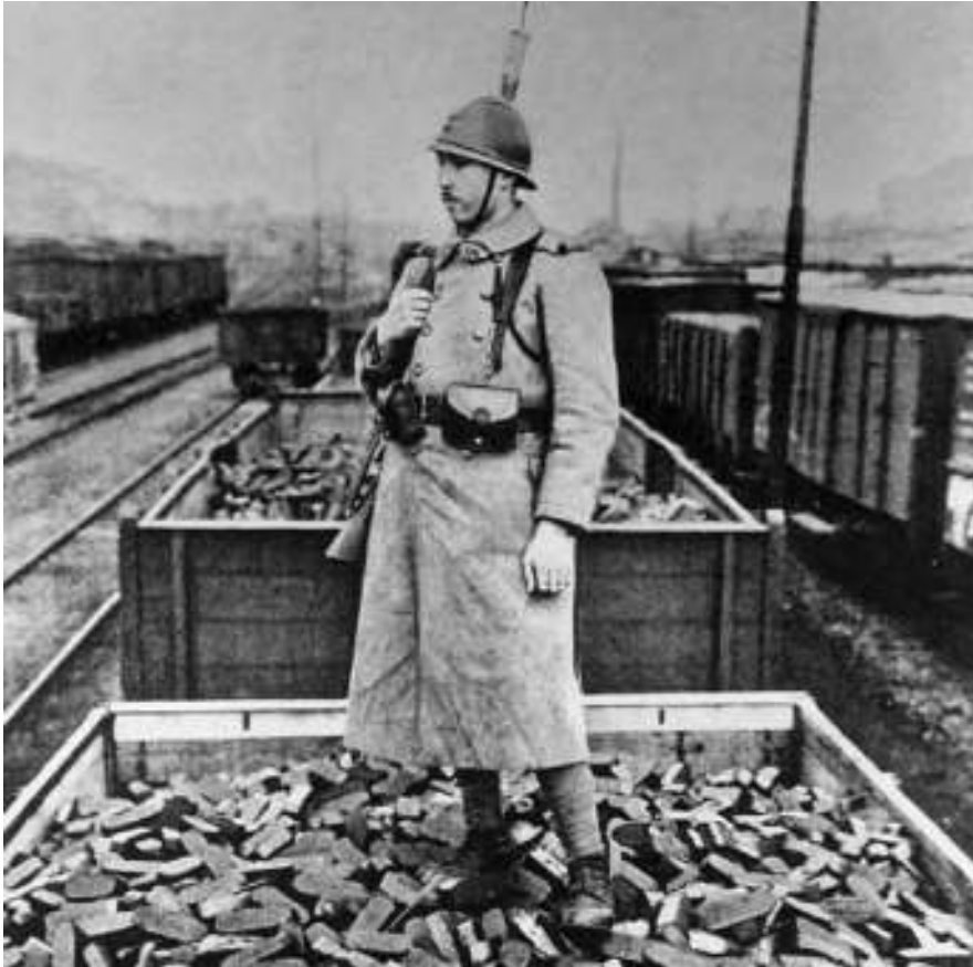
A French soldier guarding a train full of German coal from the Ruhr in 1923.