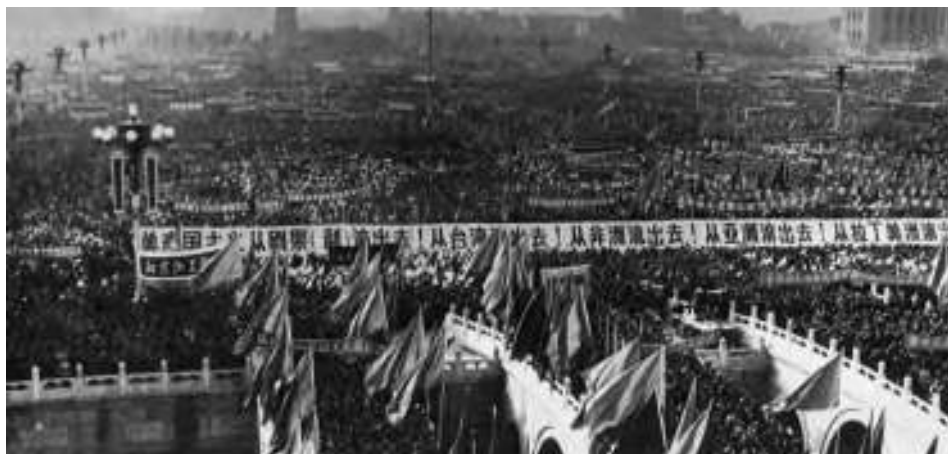
A rally of 700 000 Red Guards in Beijing in 1966.

16 Study the photograph, and then answer the questions which follow.