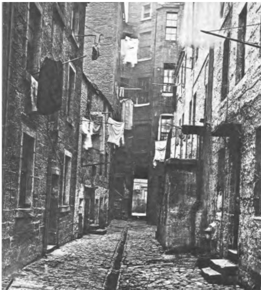
Housing in Glasgow, Scotland, 1868.

22 Study the photograph, and then answer the questions which follow.