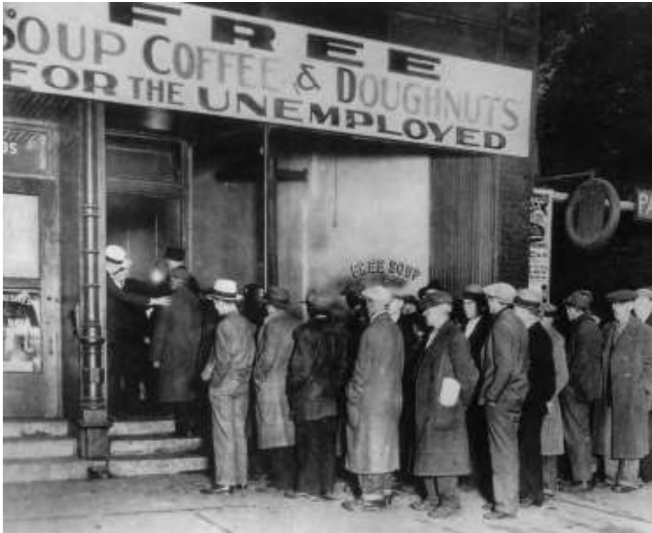
Unemployed people queuing at Al Capone's soup kitchen in Chicago in 1930.

13 Study the photograph, and then answer the questions which follow.