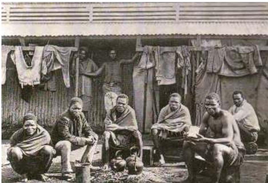
Black mine workers in their compound in the early-twentieth century.

17 Study the photograph, and then answer the questions which follow.