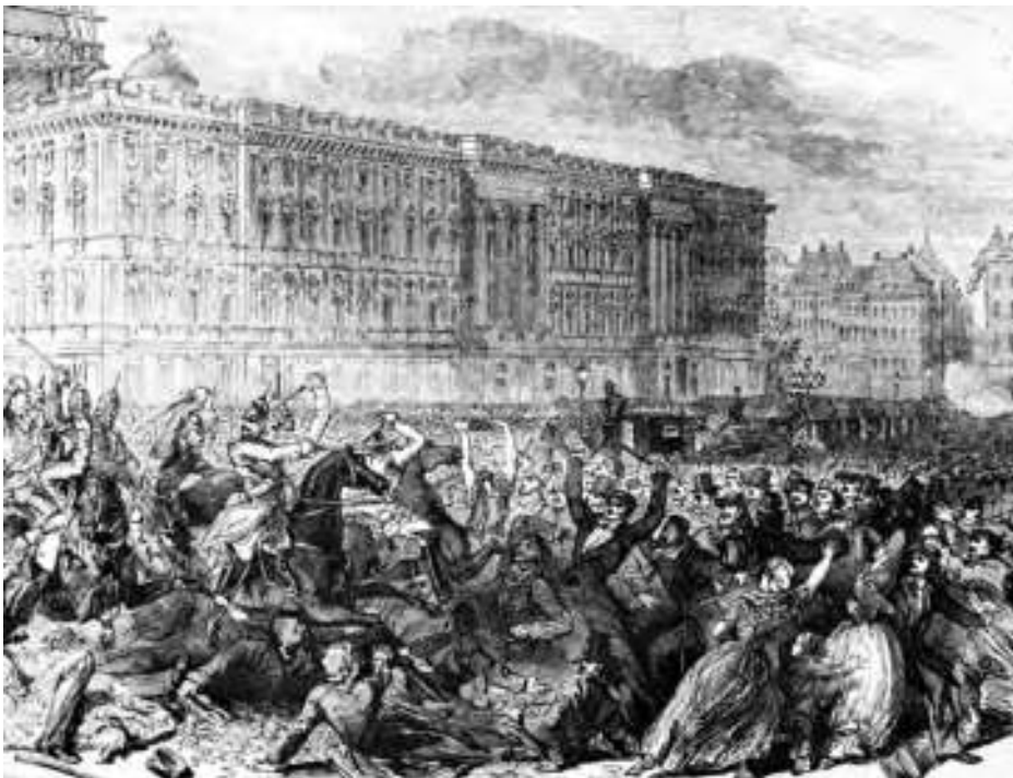
Prussian cavalry charging rioters in front of the Royal Palace, Berlin, 1848.