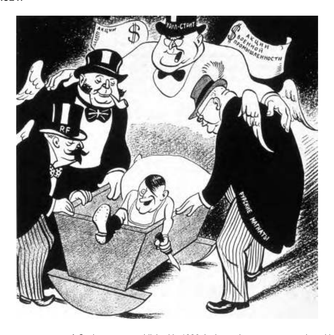
A Soviet cartoon published in 1936. It shows the western countries with Hitler.