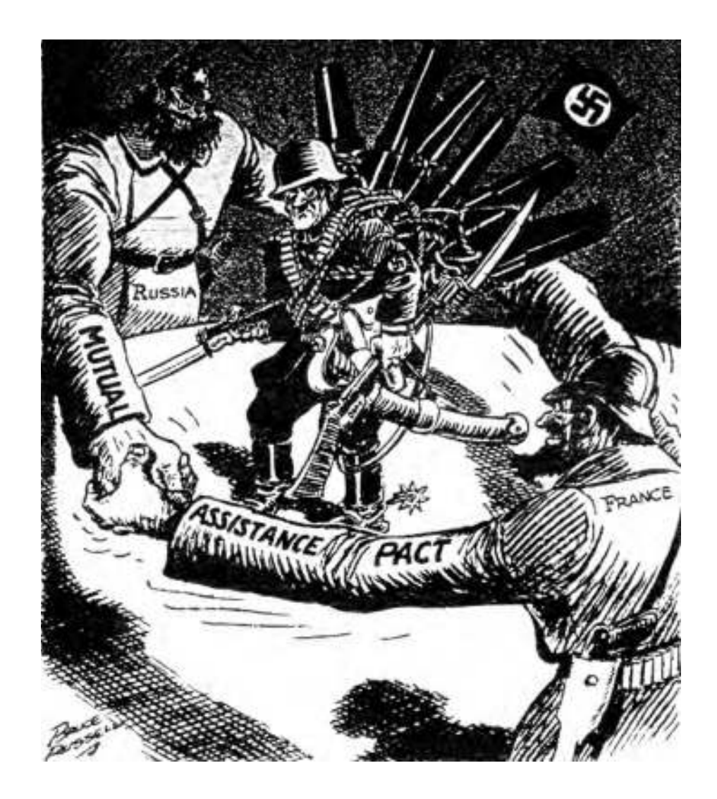
An American cartoon published in March 1936.