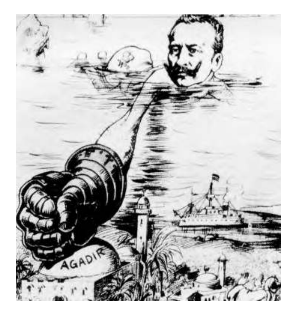
A cartoon about the Second Moroccan Crisis, published in 1911.