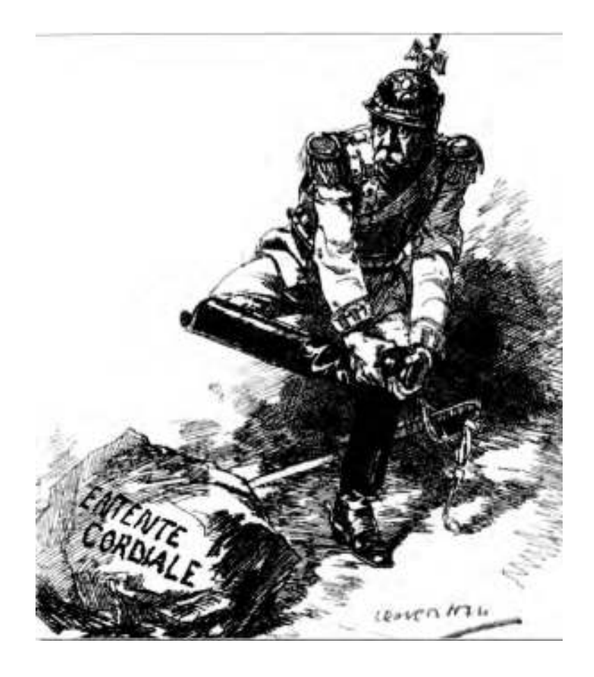
A cartoon about the Second Moroccan Crisis published in August 1911. The figure representing Germany is saying 'Oh No! It's rock. I thought it was going to be paper.'