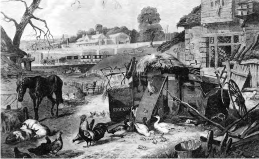
A painting of 1850 called 'Past and Present Through Victorian Eyes'.