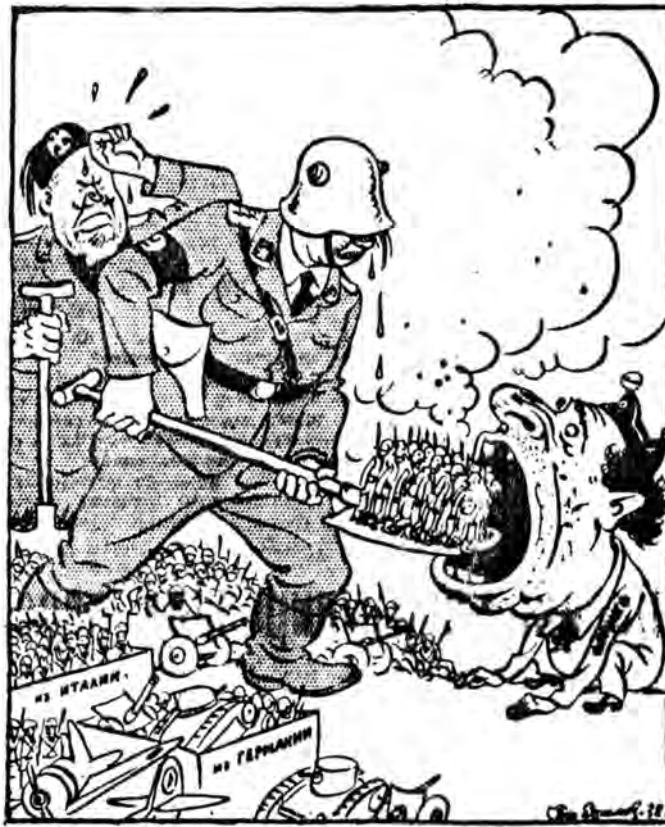
Рис. Бор. Ефимова.