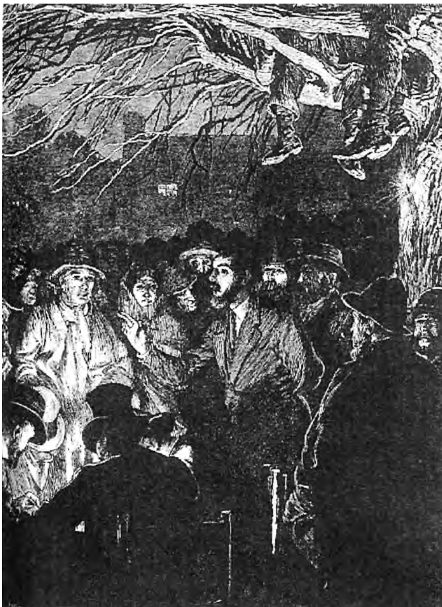
Joseph Arch speaking to members of the National Agricultural Labourers' Union in the 1870s. The meeting was held at night for fear of victimisation by landowners.

23 Study the illustration, and then answer the questions which follow.