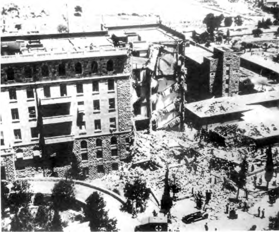
The King David Hotel in Jerusalem following a terrorist attack, 1946.

20 Study the photograph, and then answer the questions which follow.