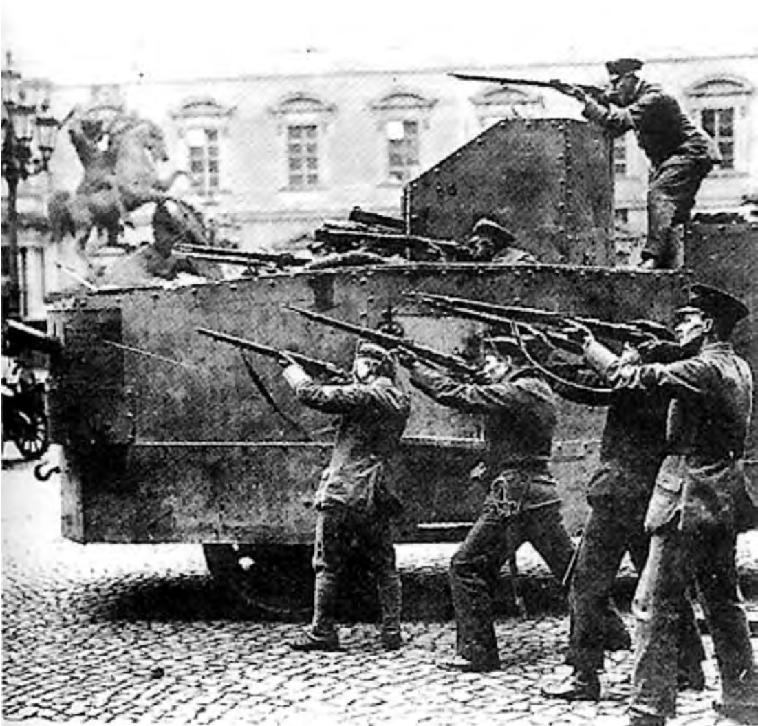
The Freikorps in action in 1919.