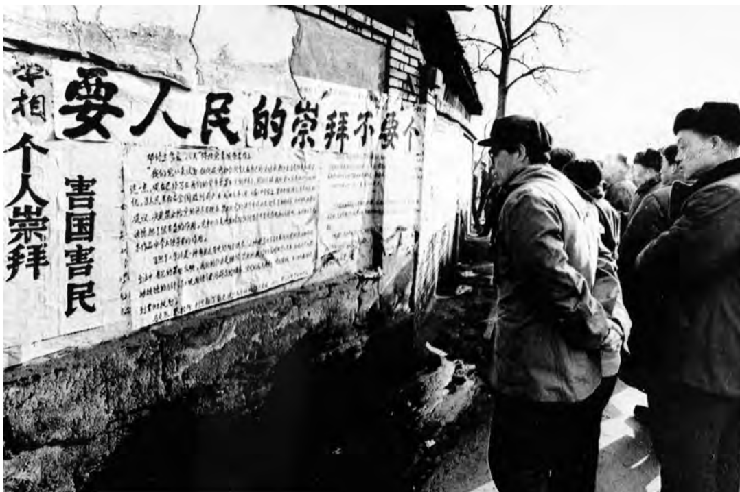
The 'Democracy Wall' in Beijing, 1979.

16 Study the photograph, and then answer the questions which follow.