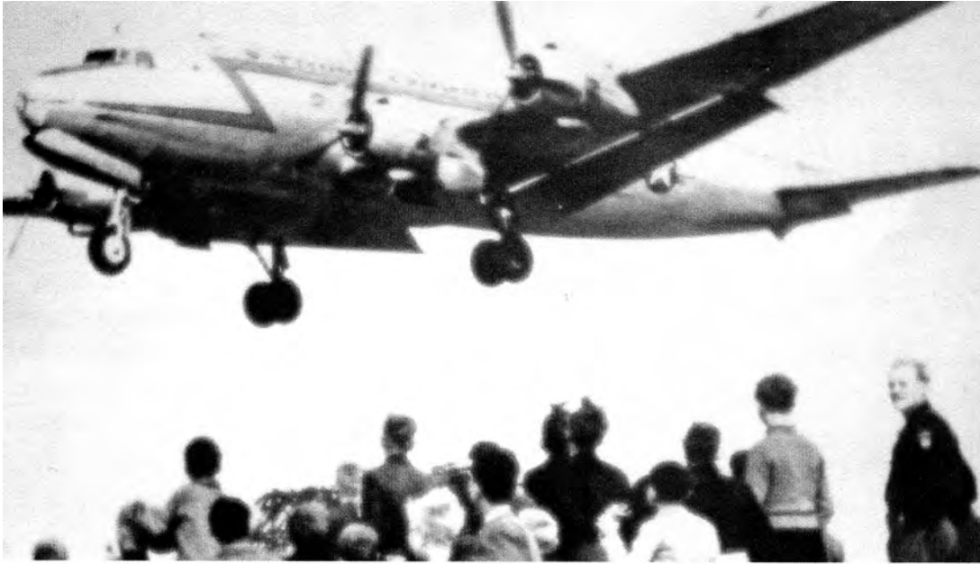
West Berliners watching a US cargo plane landing.

7 Study the photograph, and then answer the questions which follow.