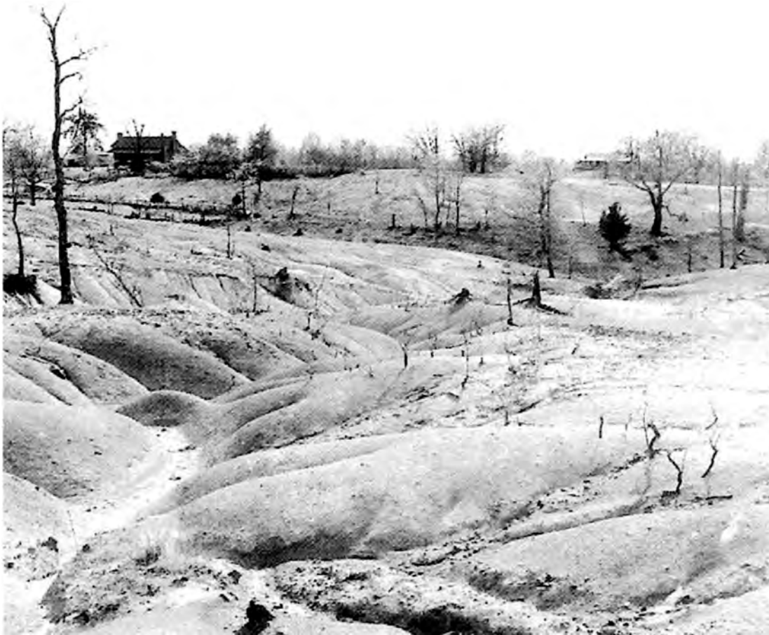
Effects of erosion in the Tennessee Valley.

14 Study the photograph, and then answer the questions which follow.