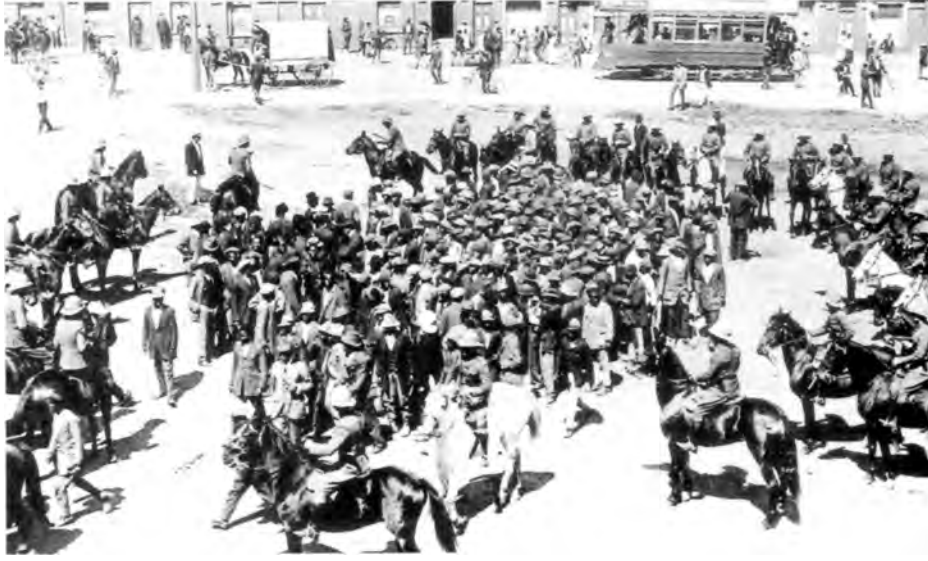
Anti-pass demonstrators being arrested in Johannesburg, 1919.

17 Study the photograph, and then answer the questions which follow.