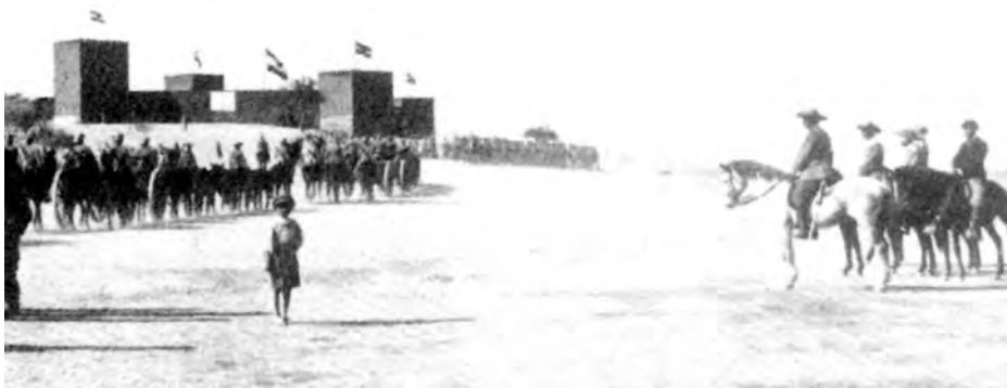
The German fort at Windhoek, 1898.

19 Study the photograph, and then answer the questions which follow.