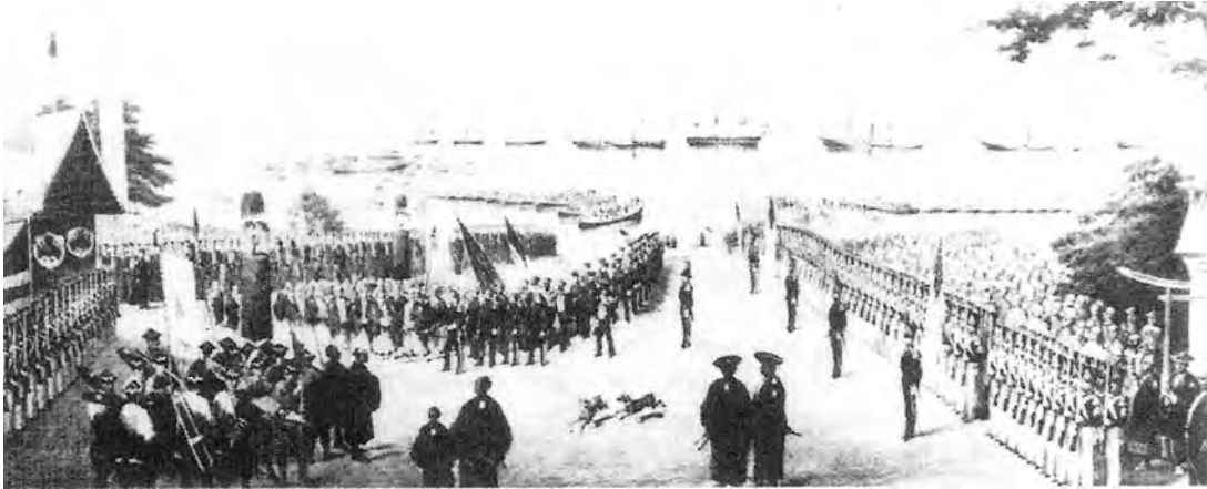
The Americans arrive to sign the Treaty of Kanagawa, 1854.