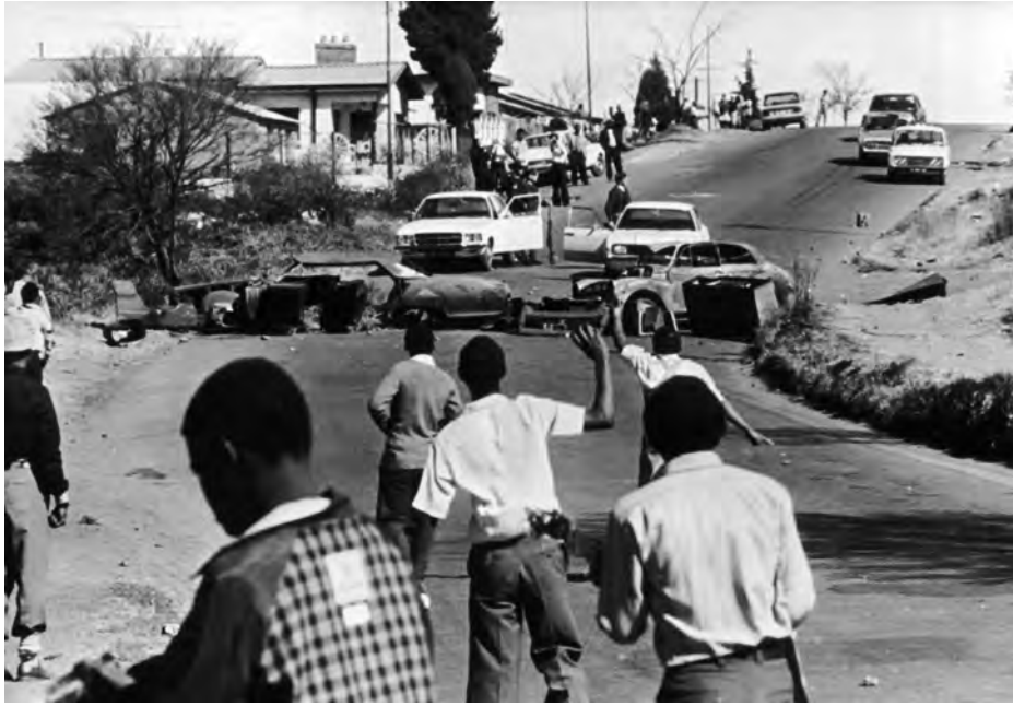
High school students on the streets of Soweto, 1976.

18 Study the photograph, and then answer the questions which follow.