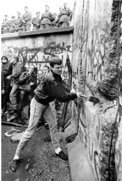
A photograph of events at the Berlin Wall in November 1989.