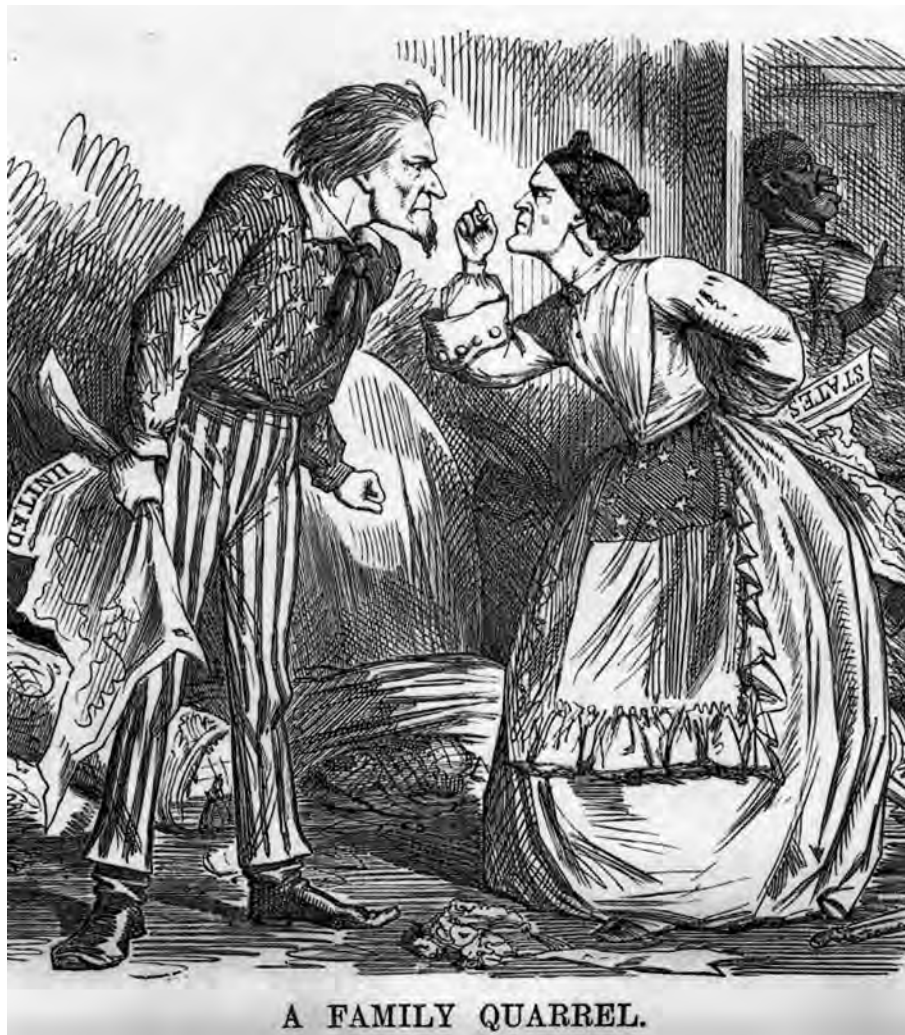
A British cartoon published in September 1861.