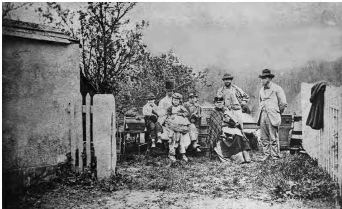
Farm labourers evicted from their home for being members of the National Agricultural Labourers' Union, 1874.

23 Study the picture, and then answer the questions which follow.