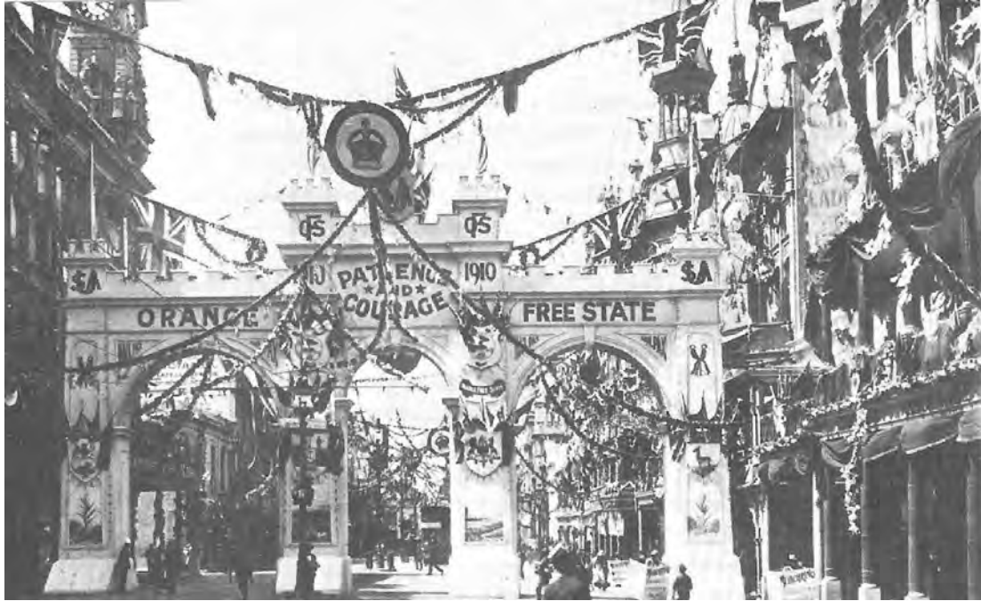
A photograph showing celebrations in South Africa on the creation of the Union, 1910.

17 Study the photograph, and then answer the questions which follow.