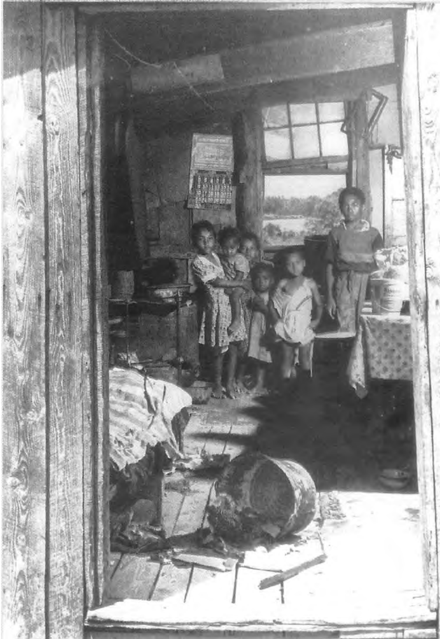
A family home in the Southern state of Virginia.

13 Study the illustration, and then answer the questions which follow.