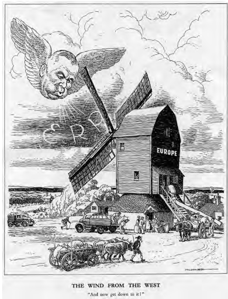
A cartoon about the Marshall Plan published in a British magazine in July 1948.