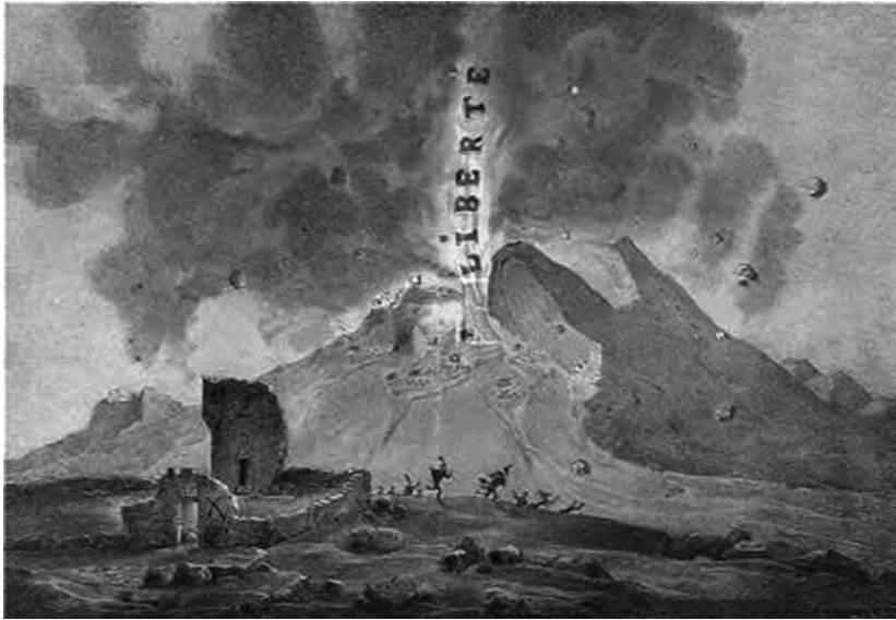
A French illustration from 1848 commenting on the events of that year.