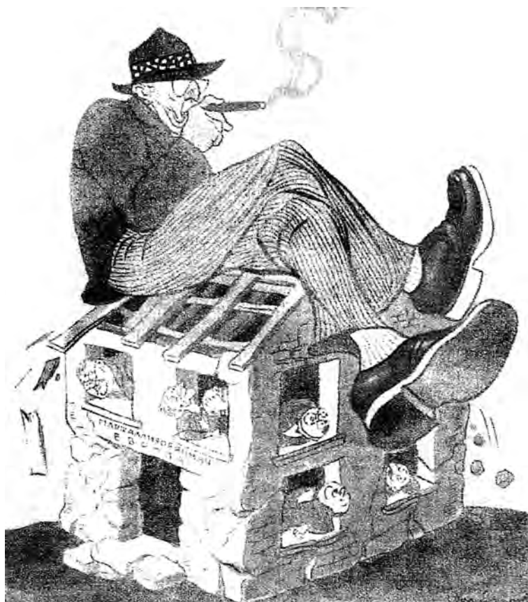
A Soviet cartoon published in 1947. The house represents Europe.