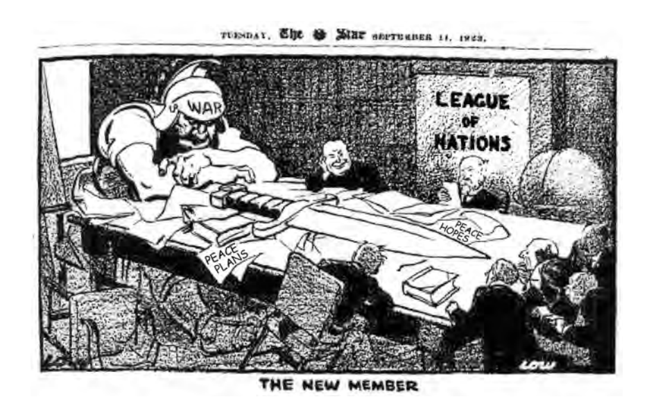
A British cartoon published in September 1923.