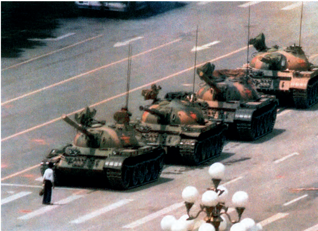
A photograph of tanks in Tiananmen Square, Beijing, June 1989.

16 Look at the photograph, and then answer the questions which follow.