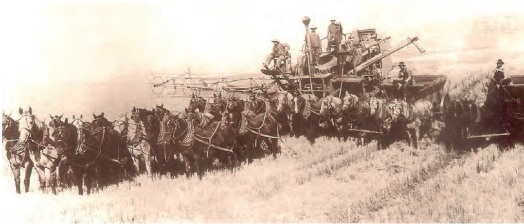
A photograph of recently introduced harvesting machinery on a farm in 1923.

13 Look at the photograph, and then answer the questions which follow.