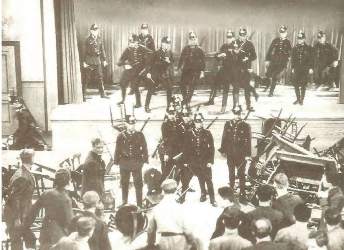
A photograph of the police dealing with the aftermath of a fight between the SA and the Communists, 1932.