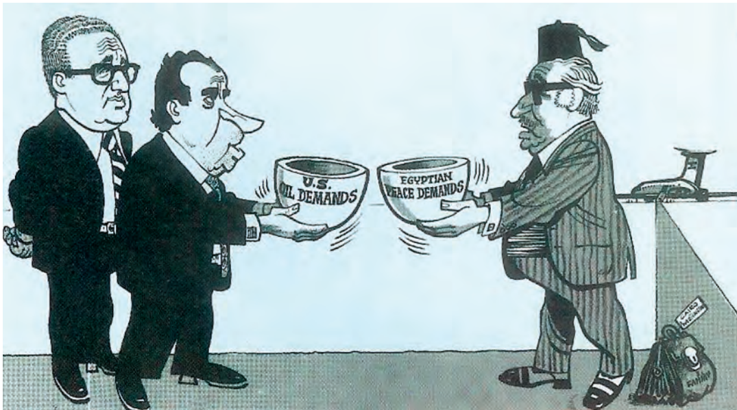
A cartoon published in a British newspaper in 1973. It shows Henry Kissinger and President Nixon negotiating with Egypt.

20 Look at the cartoon, and then answer the questions which follow.