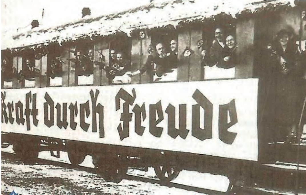
A photograph of German workers on a trip organised by the 'Strength Through Joy' movement.

10 Look at the photograph, and then answer the questions which follow.