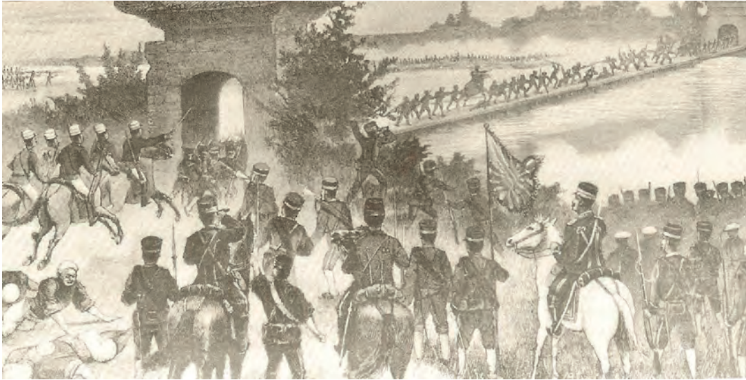
A painting of Japanese troops capturing Pyongyang in Korea during the war with China in 1894–5.