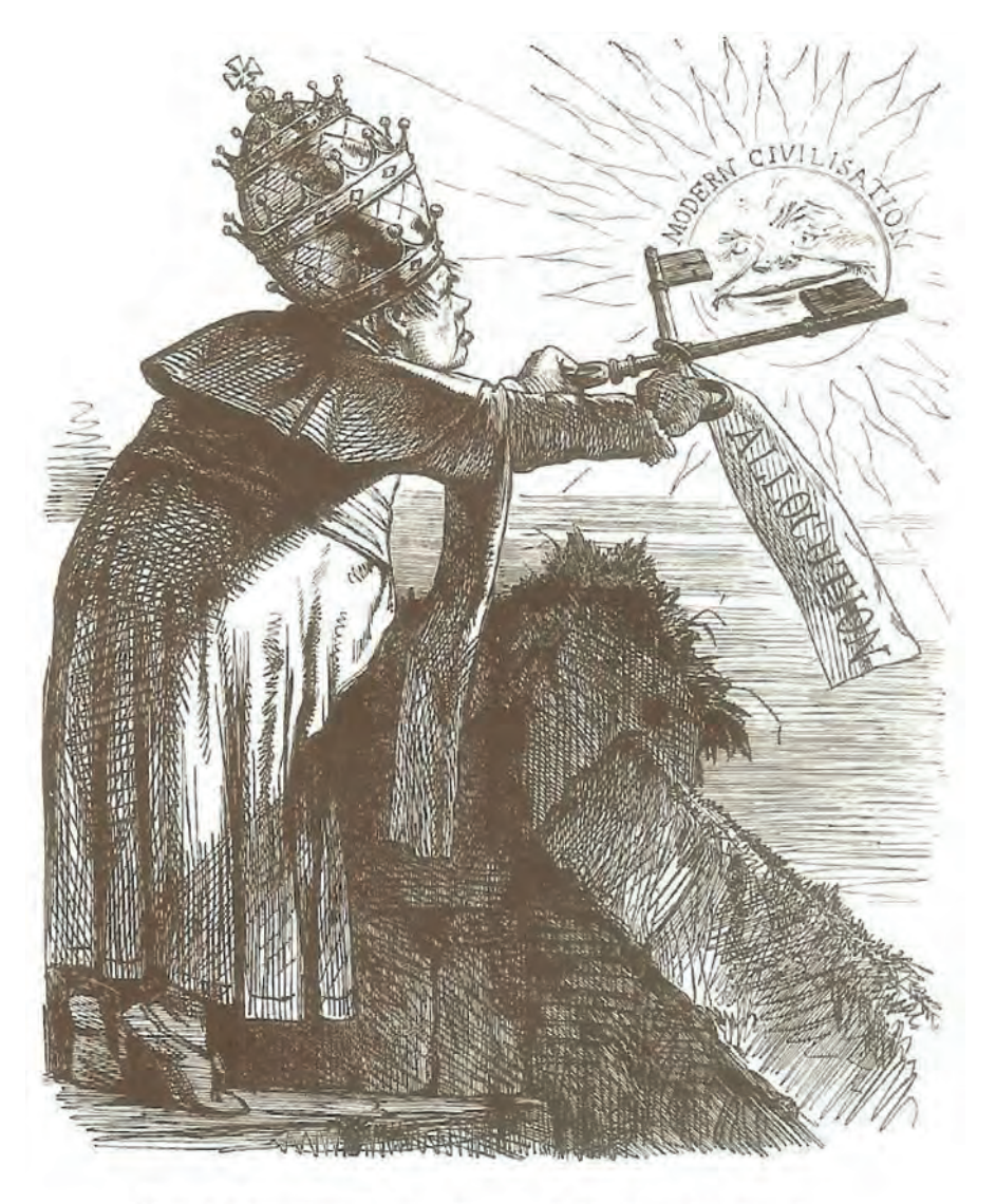
Papal Allocution .- Snuffing out Modern Civilisation.

2 Look at the cartoon, and then answer the questions which follow.