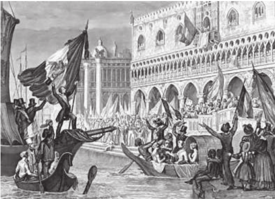
A drawing from the time of Daniele Manin proclaiming the Republic of Venice in 1848.