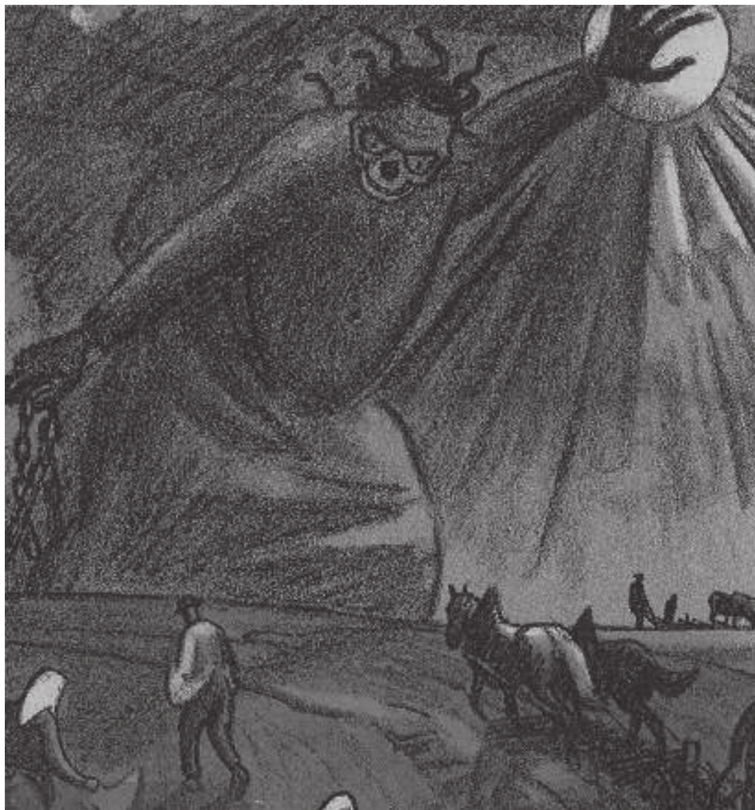
A cartoon showing German farmland, published in a German magazine, May 1919.