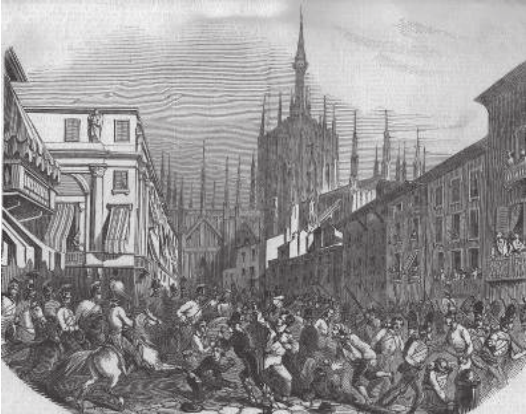
A drawing from the time of the uprising in Milan in March 1848.