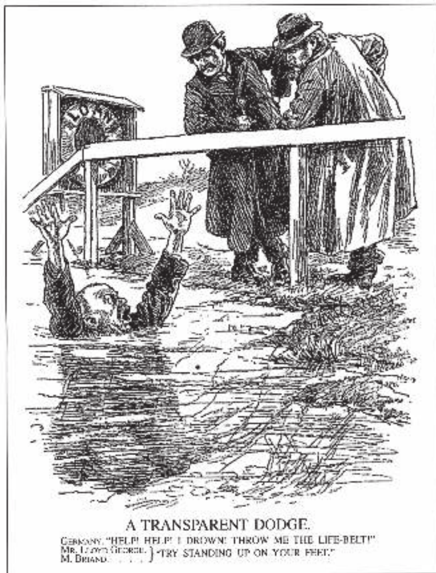
A cartoon from a British magazine, 1921. It shows Germany kneeling in the water. Lloyd George and Briand (the French Prime Minister) are on the right.