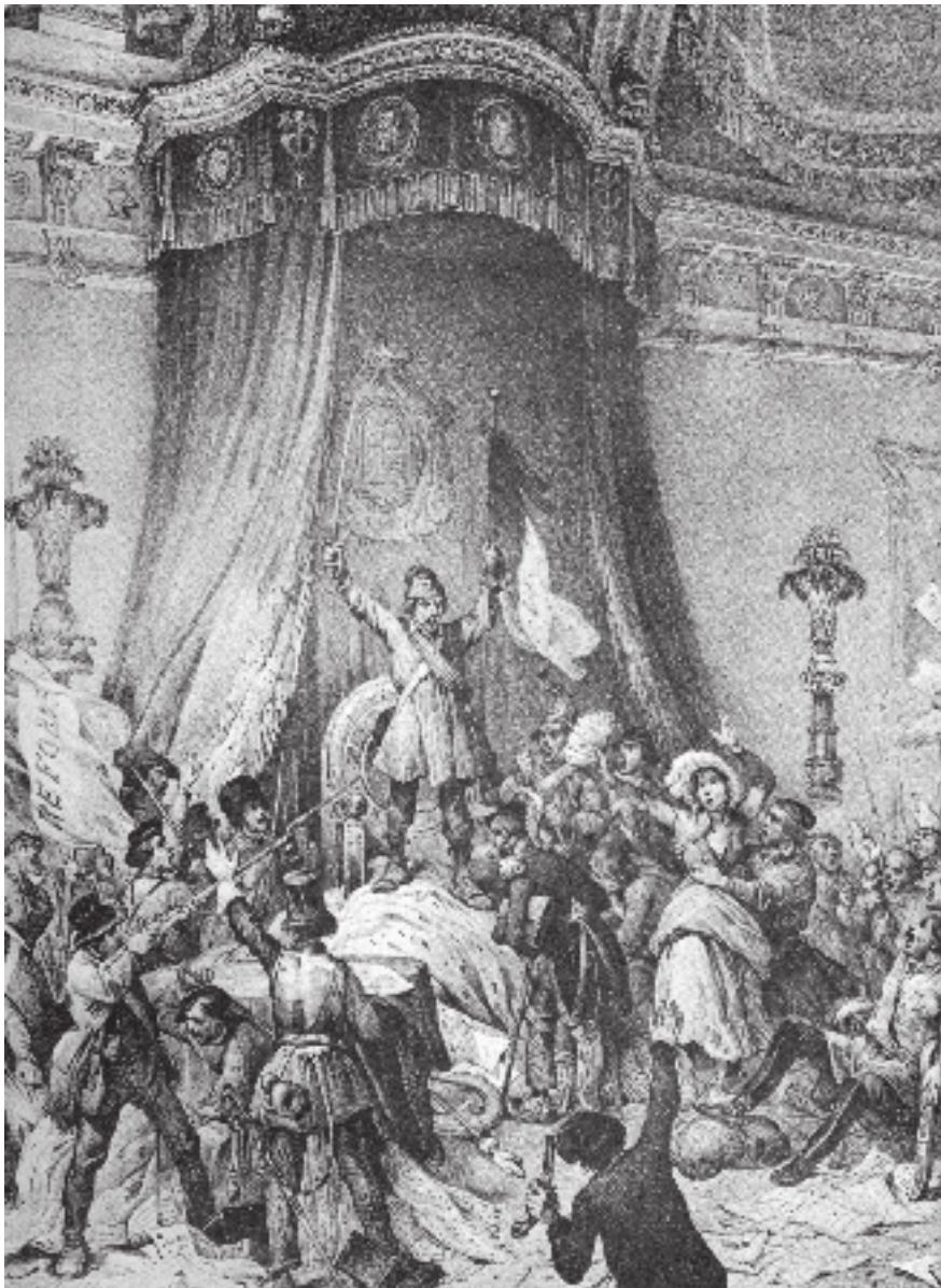
A drawing from the time of the throne room in the Tuileries, Louis Philippe's palace, 24 February 1848.