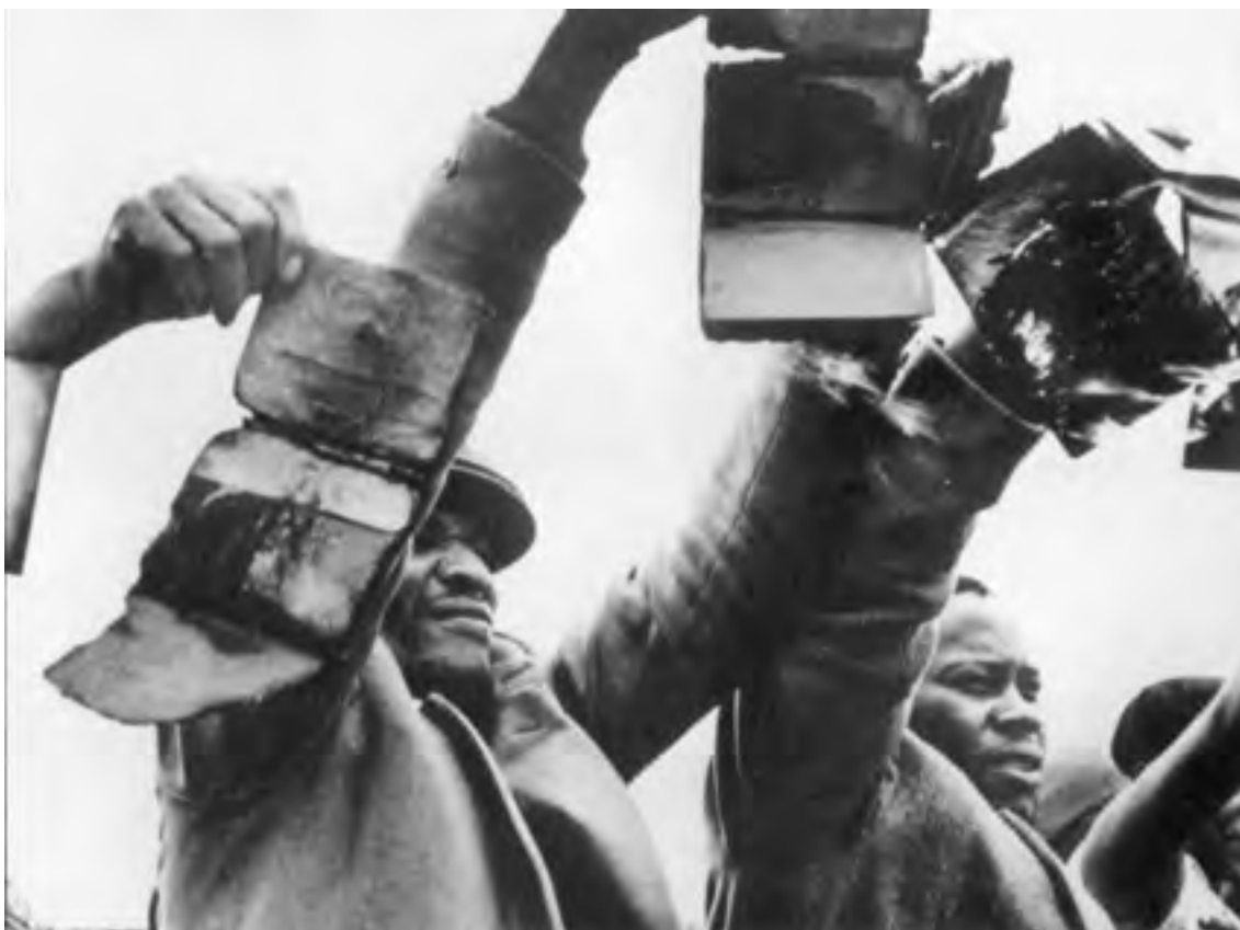
Pass books being burned in South Africa, 1960.

18 Study the photograph, and then answer the questions which follow.