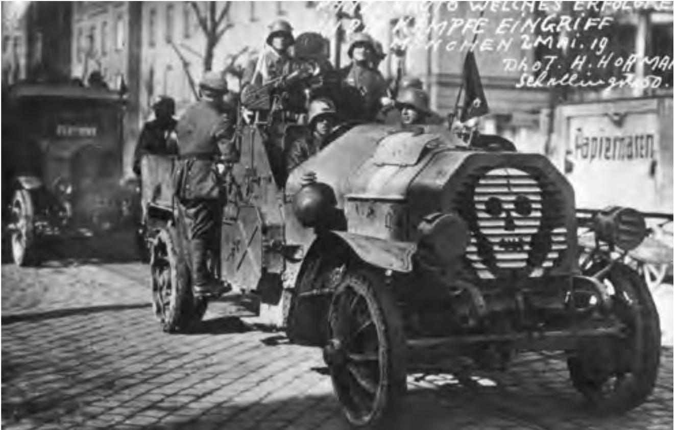
A Freikorps unit in Munich, May 1919.

9 Study the photograph, and then answer the questions which follow.