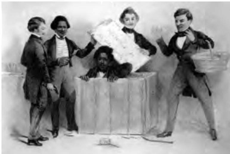
The escape of a slave from Richmond, Virginia to Philadelphia in the North.