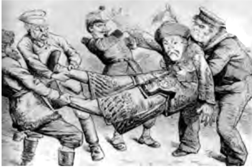
A nineteenth-century cartoon showing China being pulled by several European countries in different directions.

24 Study the cartoon, and then answer the questions which follow.