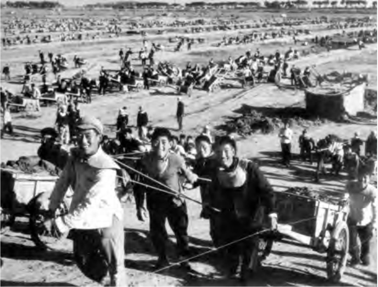
Chinese workers on the Haiho River Project.

15 Study the photograph, and then answer the questions which follow.