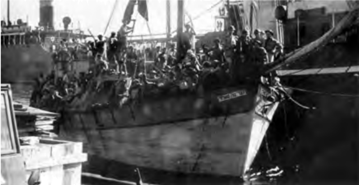
A refugee ship being sent back from Palestine to Cyprus by British soldiers in 1946.

20 Study the photograph, and then answer the questions which follow.