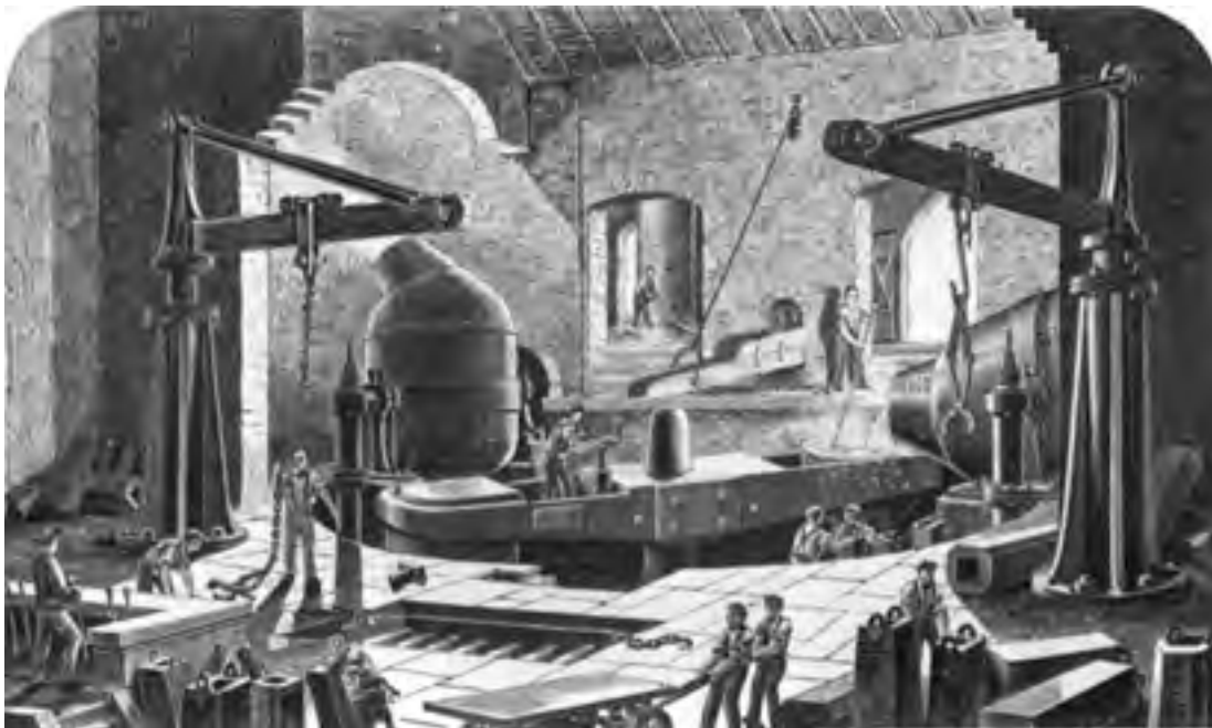
A Bessemer steel factory.

23 Study the picture, and then answer the questions which follow.