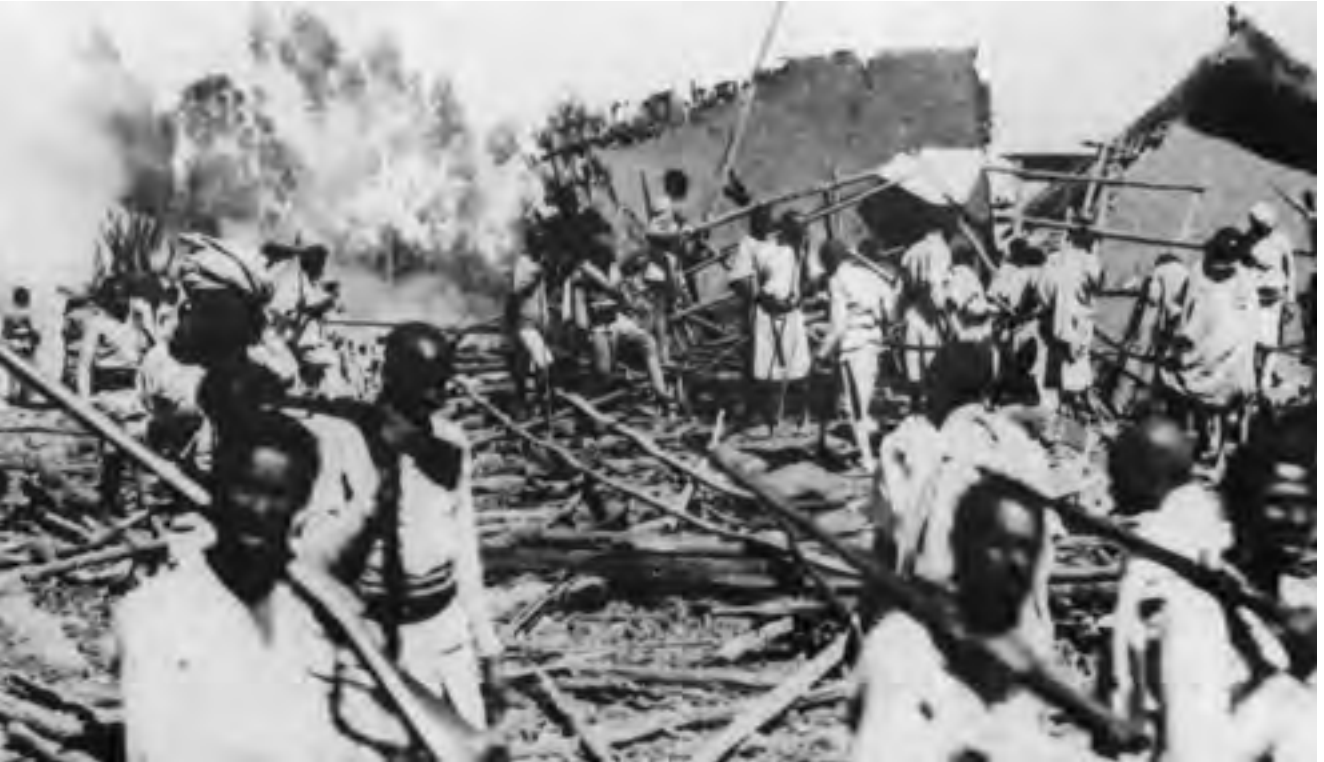
An Abyssinian village bombed by Italian aircraft in the invasion of 1936.

6 Study the photograph, and then answer the questions which follow.