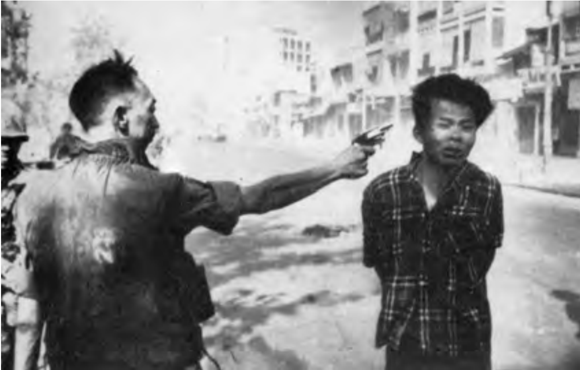
The execution of a Vietcong suspect during the Tet offensive, 1968.

7 Study the photograph, and then answer the questions which follow.