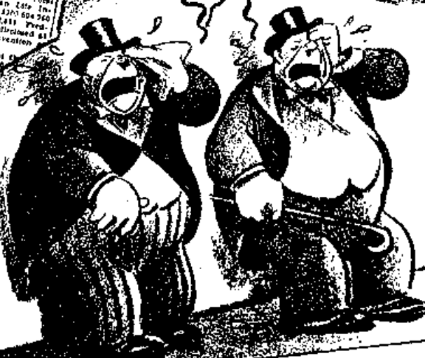
A cartoon published in a US newspaper in 1936.

Reach $24,837,478, or 46 Per Cent Above Final 1934 Mark.