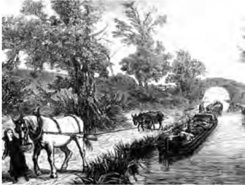
An early nineteenth-century drawing of canal barges.

22 Study the picture, and then answer the questions which follow.