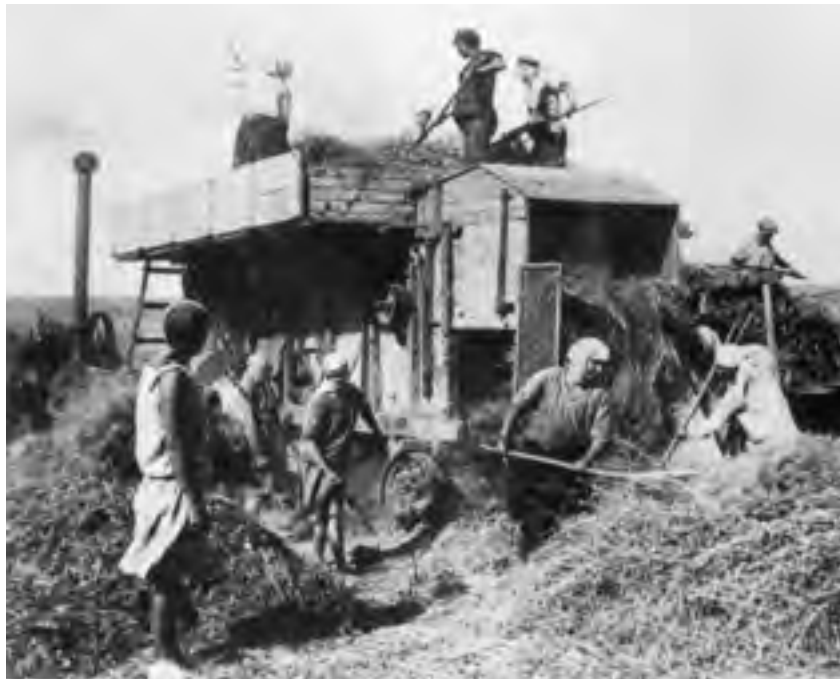
Threshing on a collective farm.

12 Study the photograph, and then answer the questions which follow.