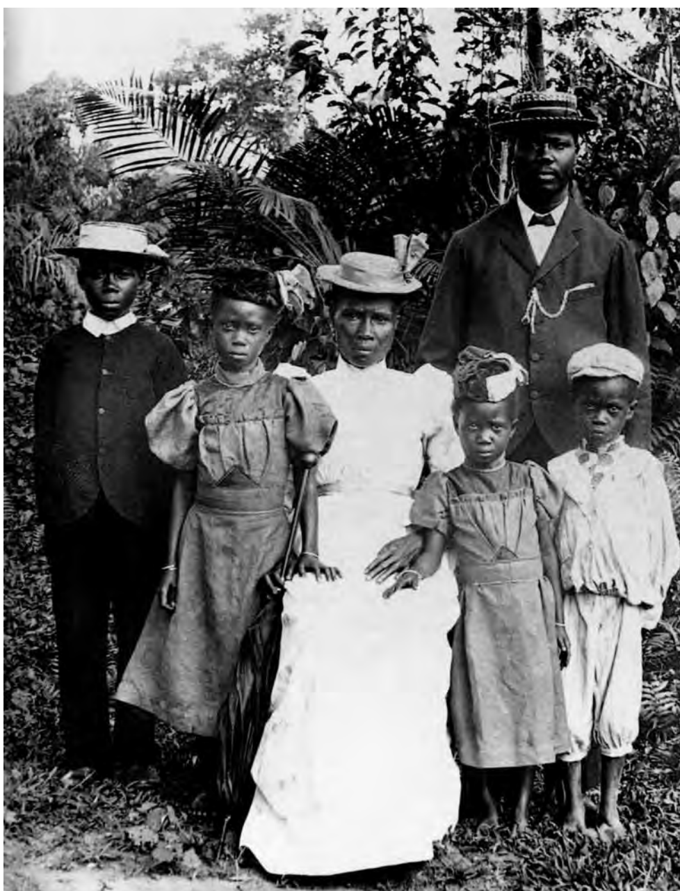
Photograph taken in 1898 of an African family who lived with Christian missionaries who wanted to show that Africans could be westernised.