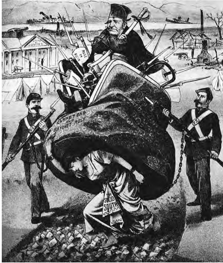
A cartoon published in 1880. The person sitting in the carpetbag is ex-President Grant, who was being considered by the Republicans as a Presidential candidate for the 1880 Presidential election.