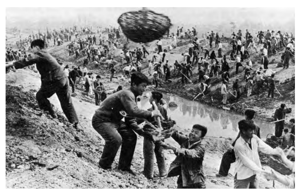
Building a new canal near Beijing during the Great Leap Forward.