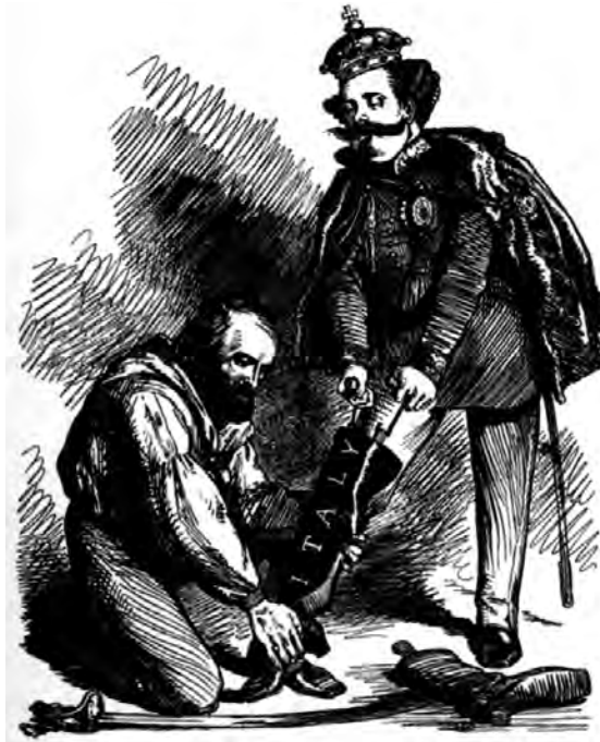
RIGHT LEG IN THE BOOT AT LAST.

“IF IT WON’T GO ON, SIRE, TRY A LITTLE MORE POWDER.”