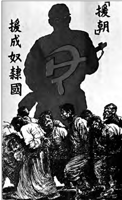
A South Korean poster from 1950 showing what the South Koreans feared would happen to their country.