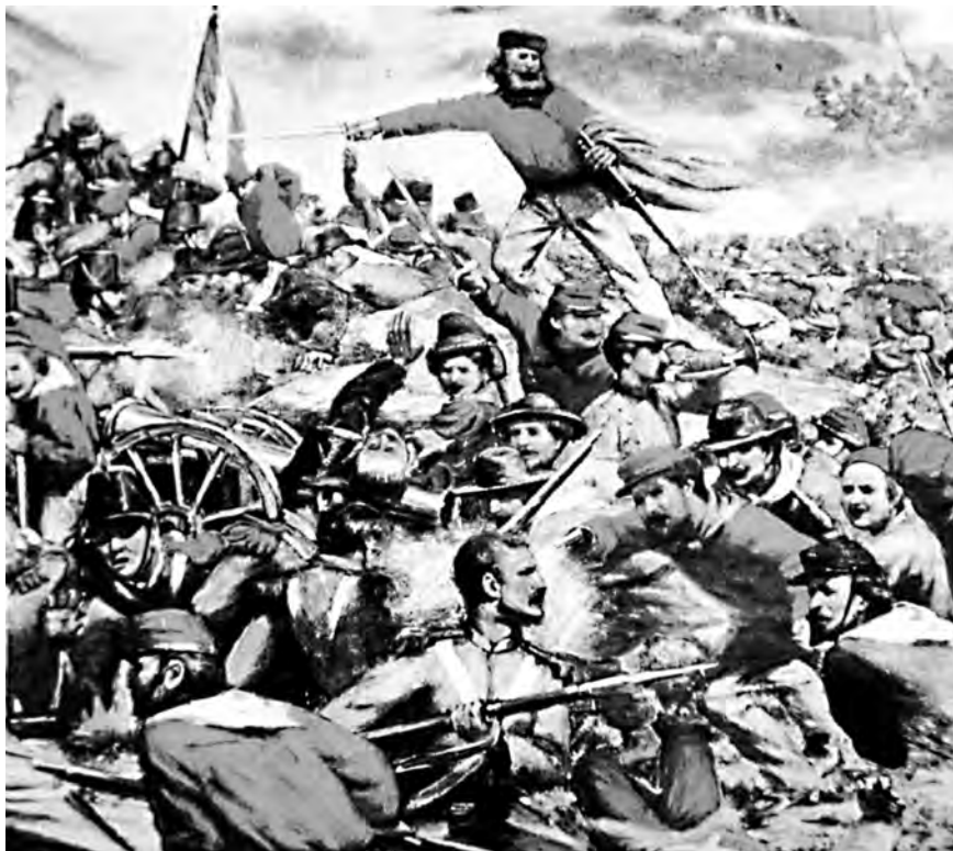
A drawing of Garibaldi at the Battle of Calatafimi in 1860 during the conquest of Sicily.