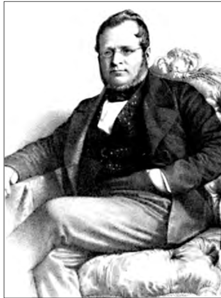
A painting of Cavour.