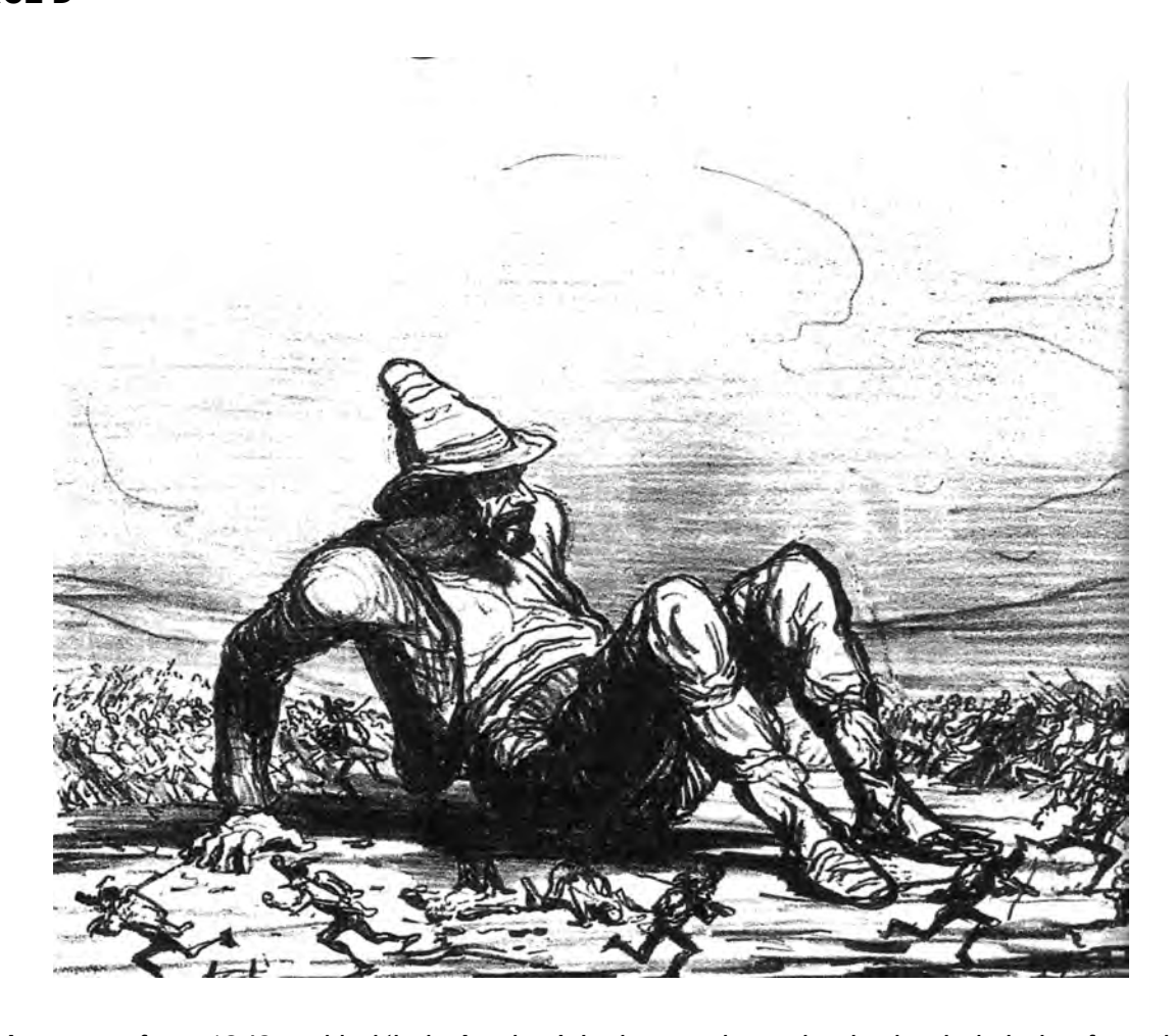
A cartoon from 1848 entitled 'Italy Awakes'. It shows a long slumbering Italy being forced awake.