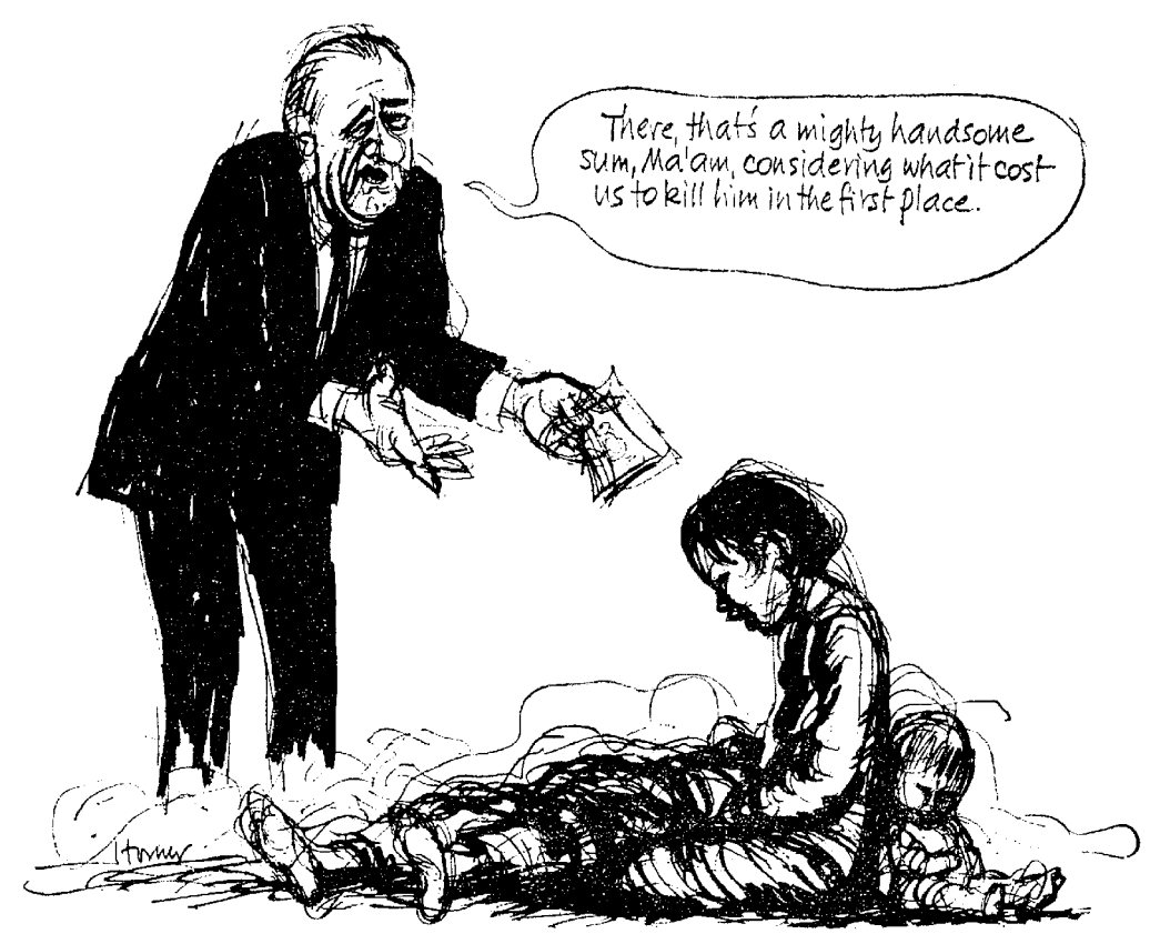
(The US is spending more than $40,000,000 per day on the war in Vietnam; compensation payments for South Vietnamese civilians killed 'by mistake' are $34 per head.)

A British cartoon published in October 1966.