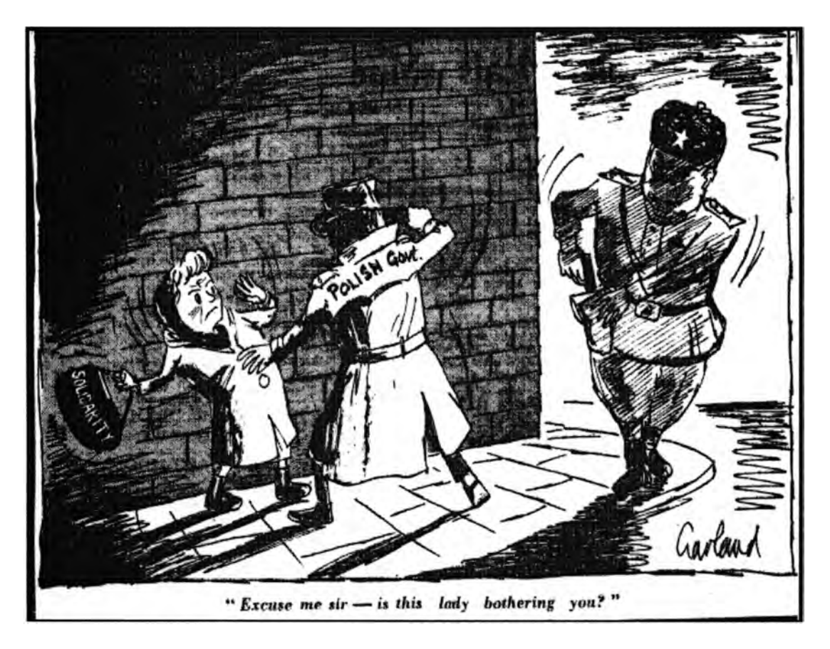
A cartoon published in an English newspaper in December 1980. The Russian soldier is saying 'Excuse me sir - is this lady bothering you?'.