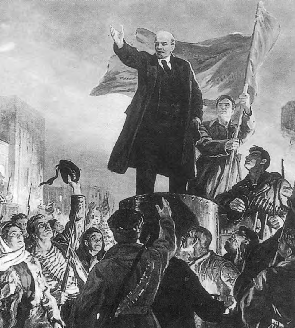
A painting of Lenin addressing a crowd on his return to Petrograd in April 1917.

11 Study the painting, and then answer the questions which follow.