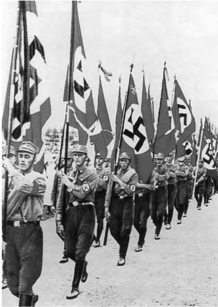
The SA parading at Nuremberg in 1933.