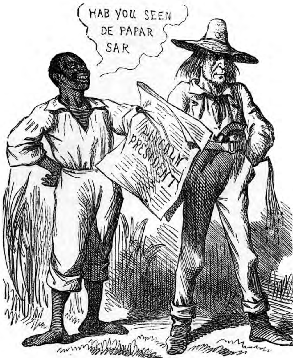
A cartoon published in December 1860. It shows a slave talking to the slave owner.