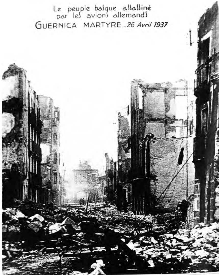
A postcard published in France shortly after the attack on Guernica. The writing at the top says, 'The Basque people murdered by the German planes. Guernica martyred – 26 April 1937.'