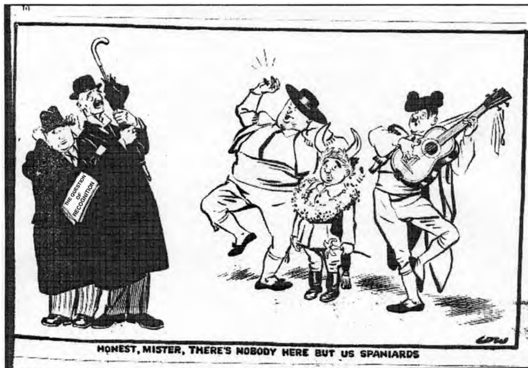
A cartoon published in Britain in February 1939. The figures on the left represent the British and French Governments. The figures on the right are Mussolini, Franco and Hitler.