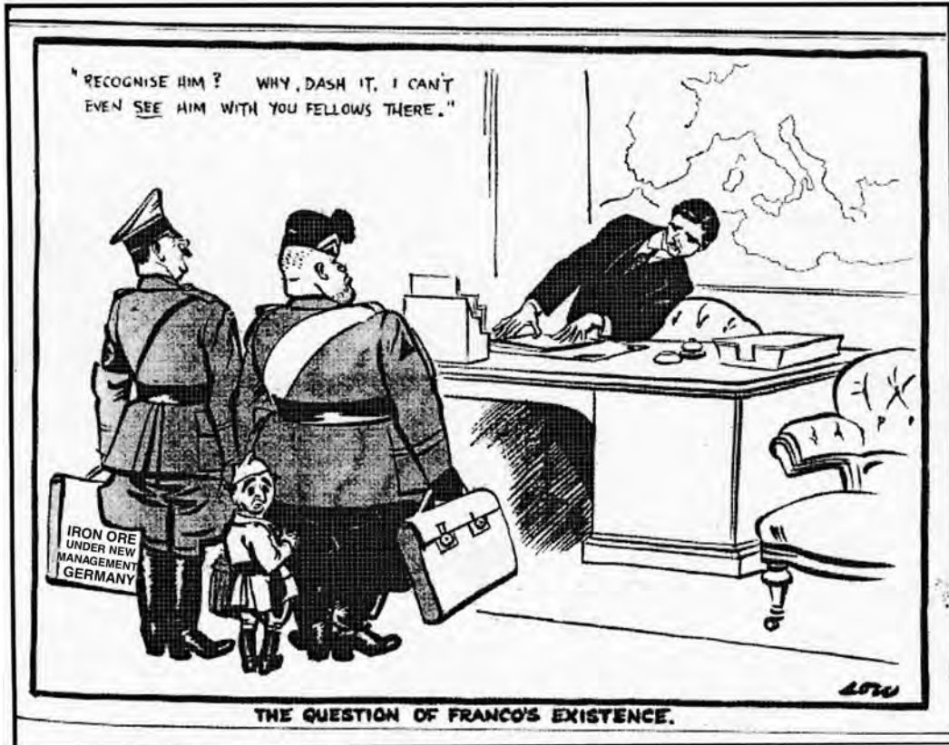
A cartoon published in Britain in July 1937. The figure behind the desk represents the British Government.