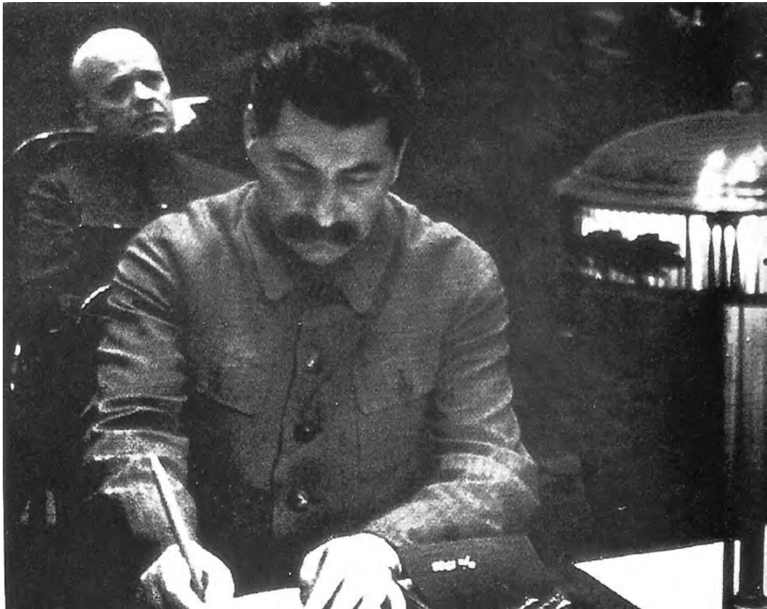
A photograph of Stalin signing death warrants. It was taken in the 1930s.

12 Look at the photograph, and then answer the questions which follow.