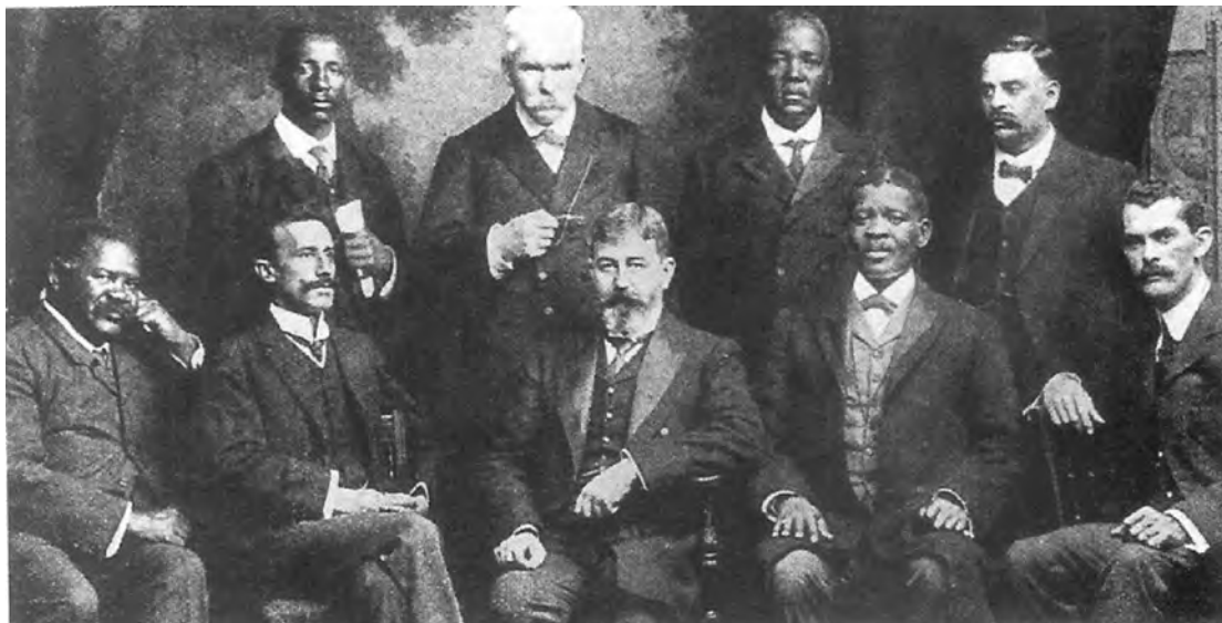
A photograph showing a South African deputation to Britain, 1909. The deputation was seeking full democratic rights for all South Africans.

17 Look at the photograph, and then answer the questions which follow.