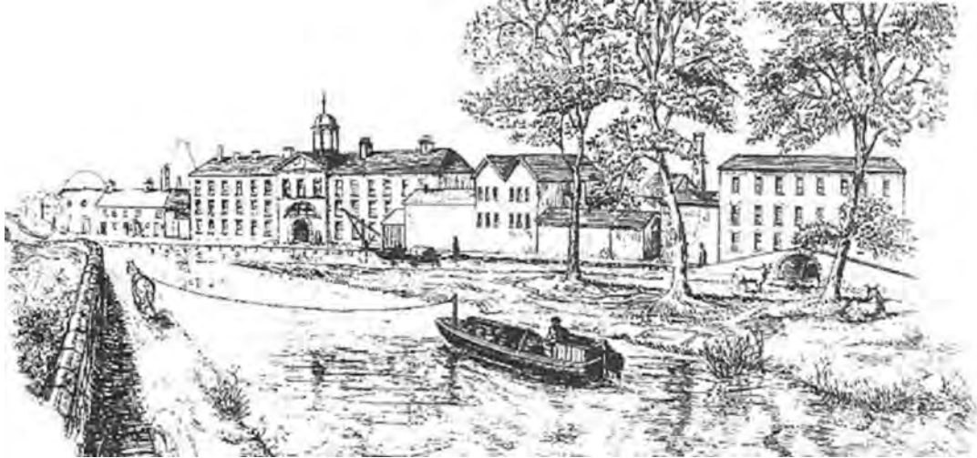
An illustration of Wedgwood's pottery works at Etruria on the banks of the Trent and Mersey Canal, c.1900.

23 Look at the illustration, and then answer the questions which follow.