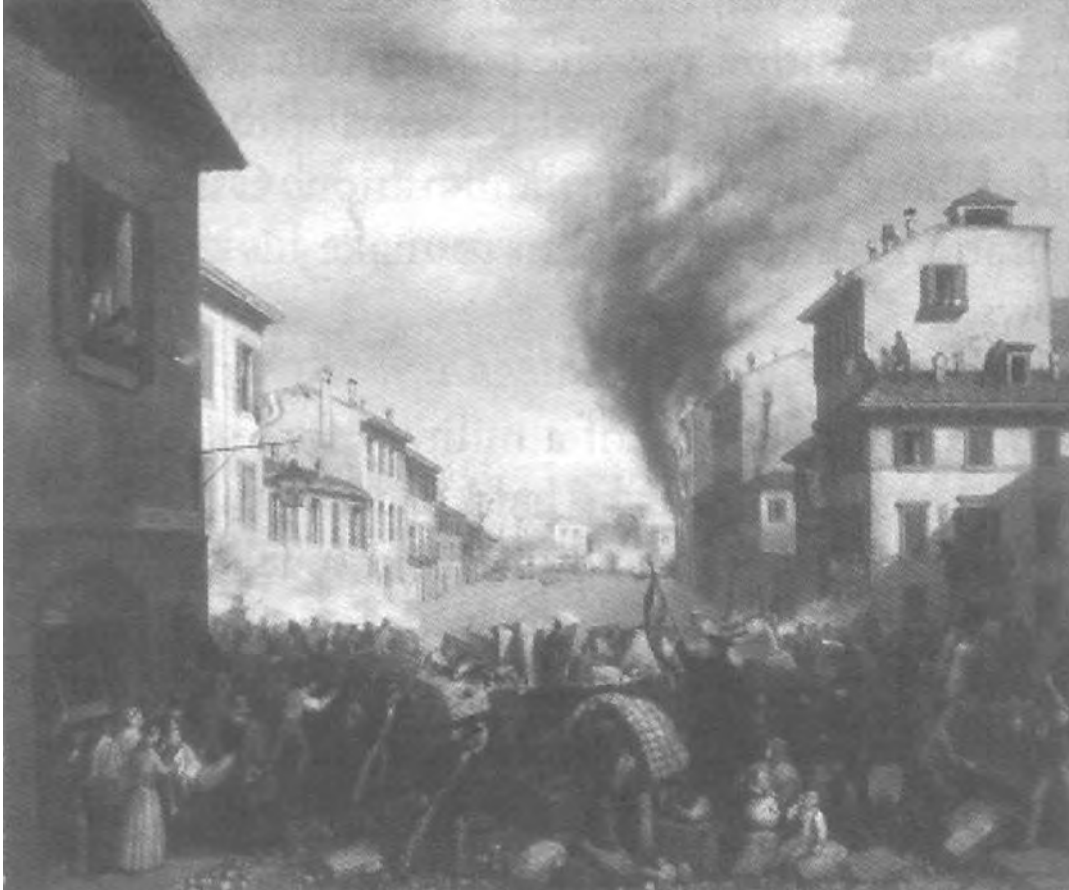
A street battle during the Milan uprising, March 1848.