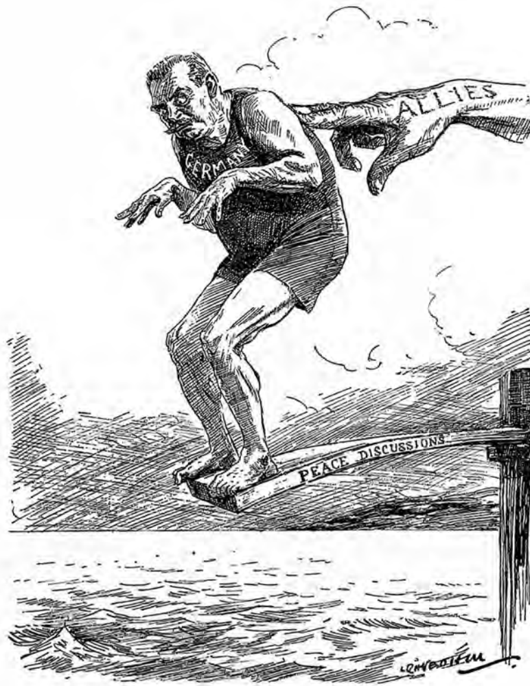
THE FINISHING TOUCH.