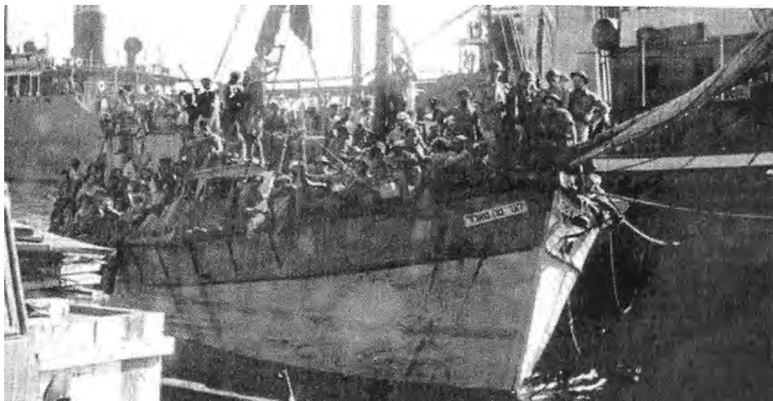
A refugee ship being sent back from Palestine to Cyprus by British soldiers in 1946.

20 Look at the photograph, and then answer the questions which follow.