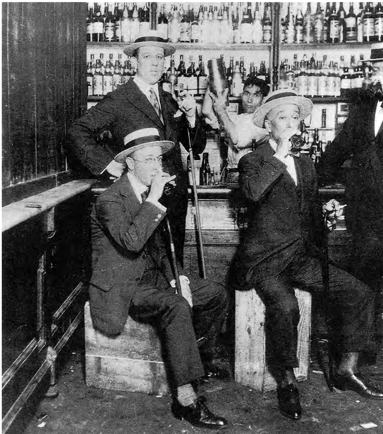
A photograph of a speakeasy.

13 Look at the photograph, and then answer the questions which follow.