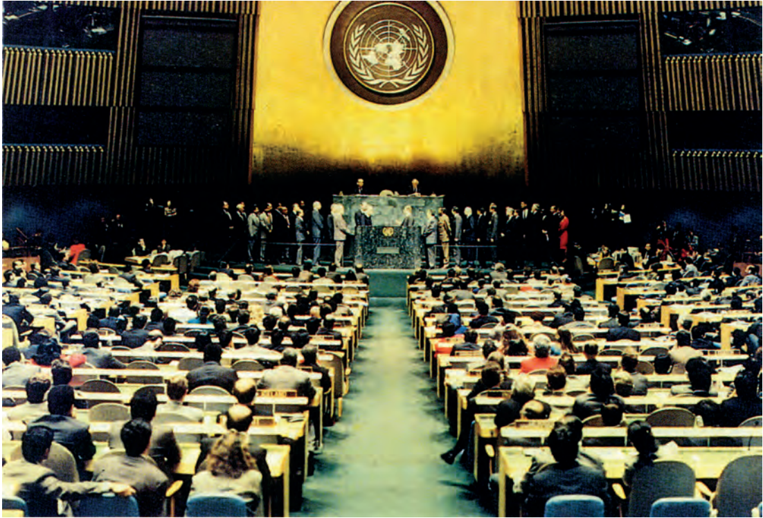
A photograph of the General Assembly of the United Nations in session.