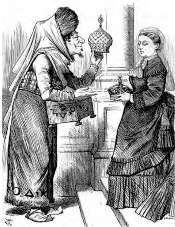
“NEW CROWNS FOR OLD ONES!”

25 Look at the cartoon, and then answer the questions which follow.