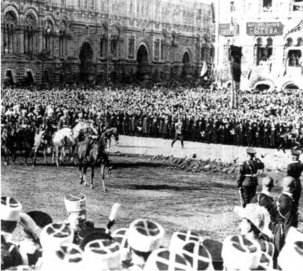
A photograph of Tsar Nicholas II at the 1913 celebrations of 300 years of Romanov rule. This was the first time since 1905 that he had appeared in public.

11 Look at the photograph, and then answer the questions which follow.