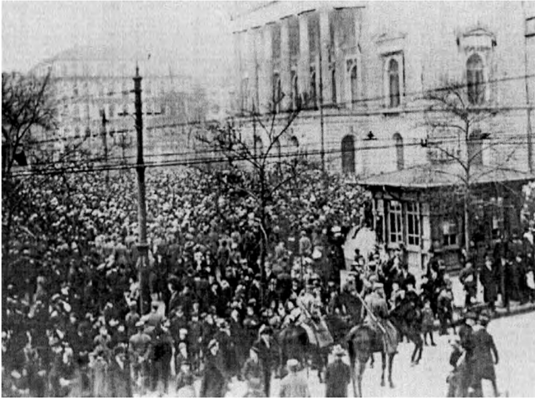
A photograph taken in Berlin in 1920 during the general strike.