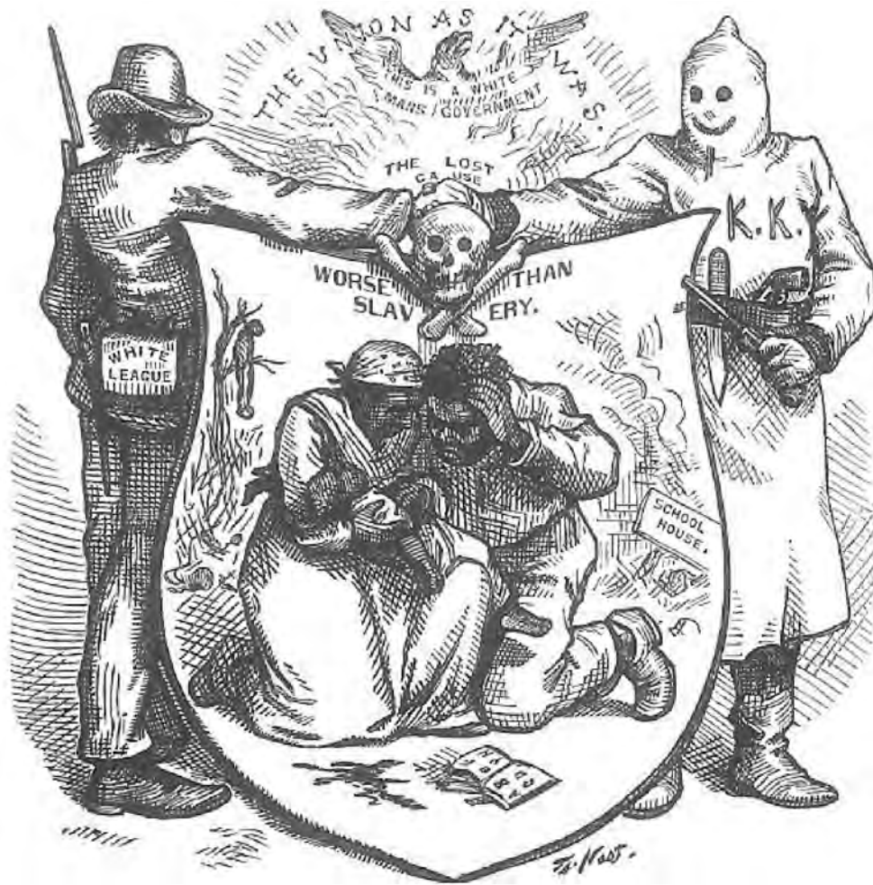
An American cartoon showing the relationship of the White League and the Ku Klux Klan.

3 Look at the illustration, and then answer the questions which follow.