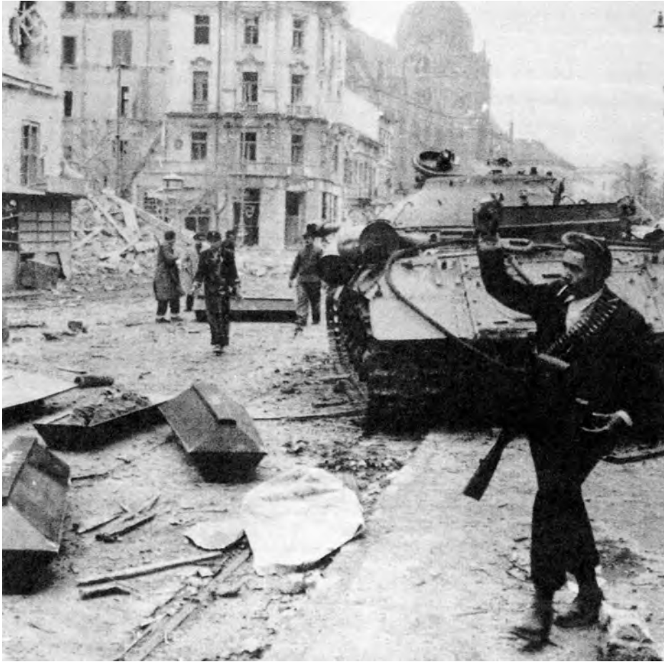
A photograph taken during the Soviet army's invasion of Hungary in 1956.

7 Look at the photograph, and then answer the questions which follow.