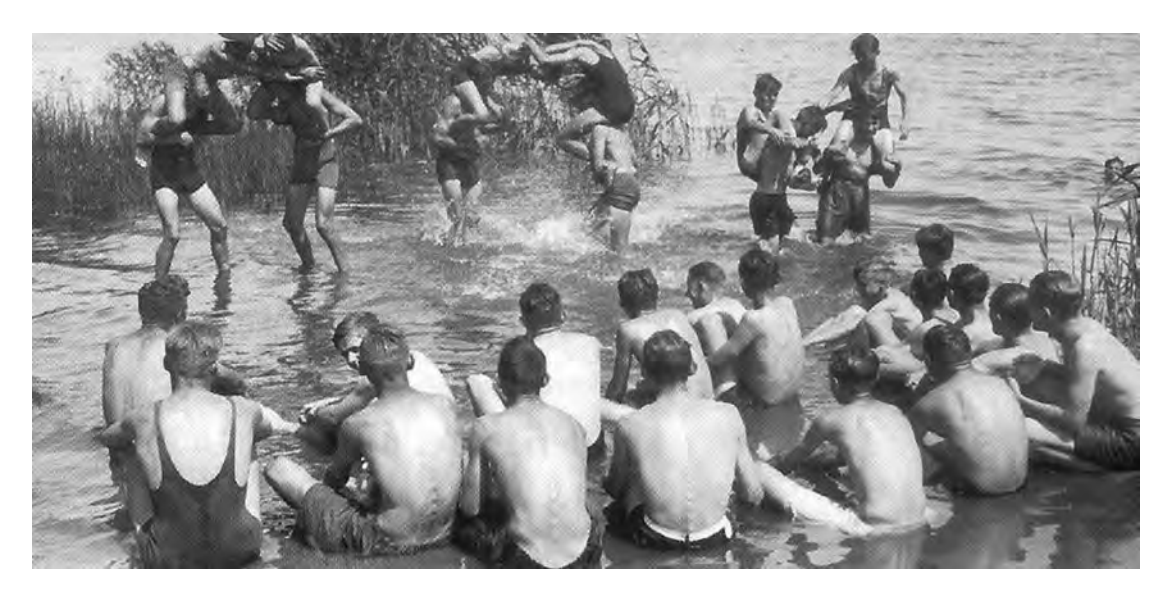
A photograph of members of the Hitler Youth, taken in the 1930s.

10 Look at the photograph, and then answer the questions which follow.