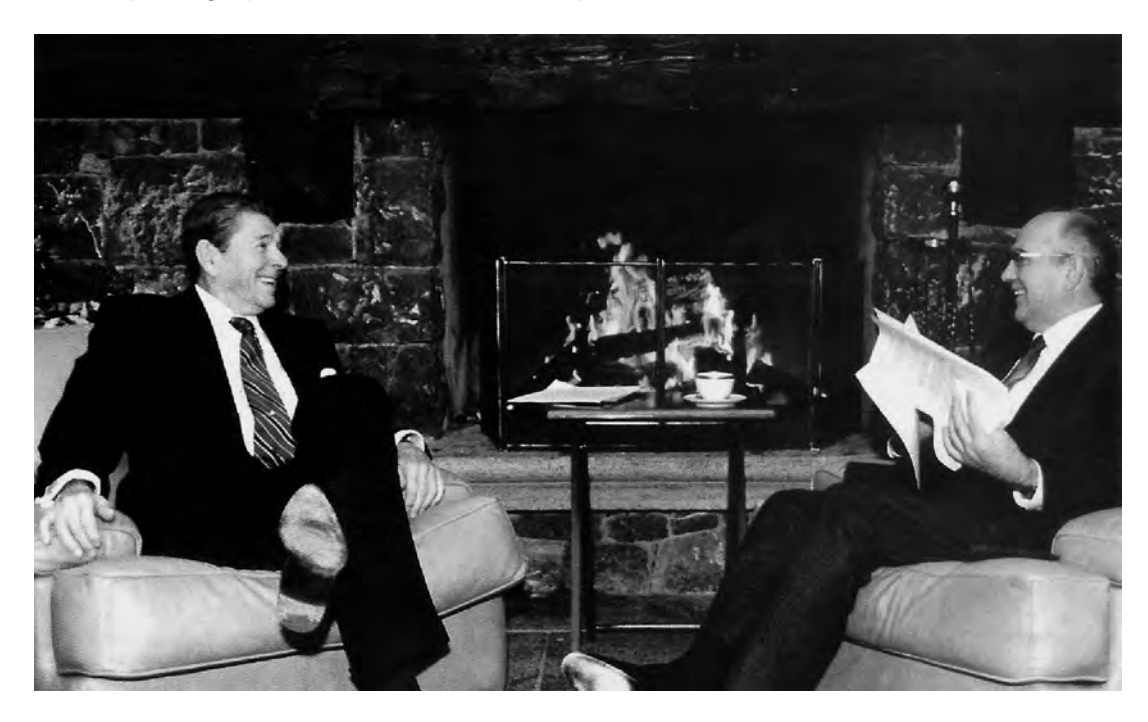
A photograph of a meeting between Reagan and Gorbachev in 1987.

8 Look at the photograph, and then answer the questions which follow.