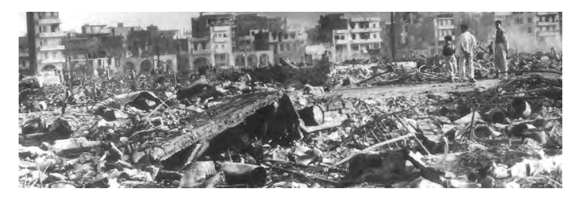
A photograph of Port Said, at the northern end of the Suez Canal, after British bombing, October 1956.

20 Look at the photograph, and then answer the questions which follow.