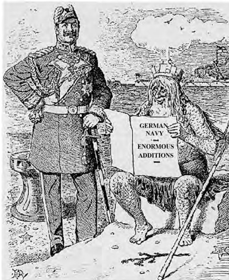
A British cartoon published in 1900. Neptune, god of the sea, is saying 'Have I got to learn German at my time of life?'