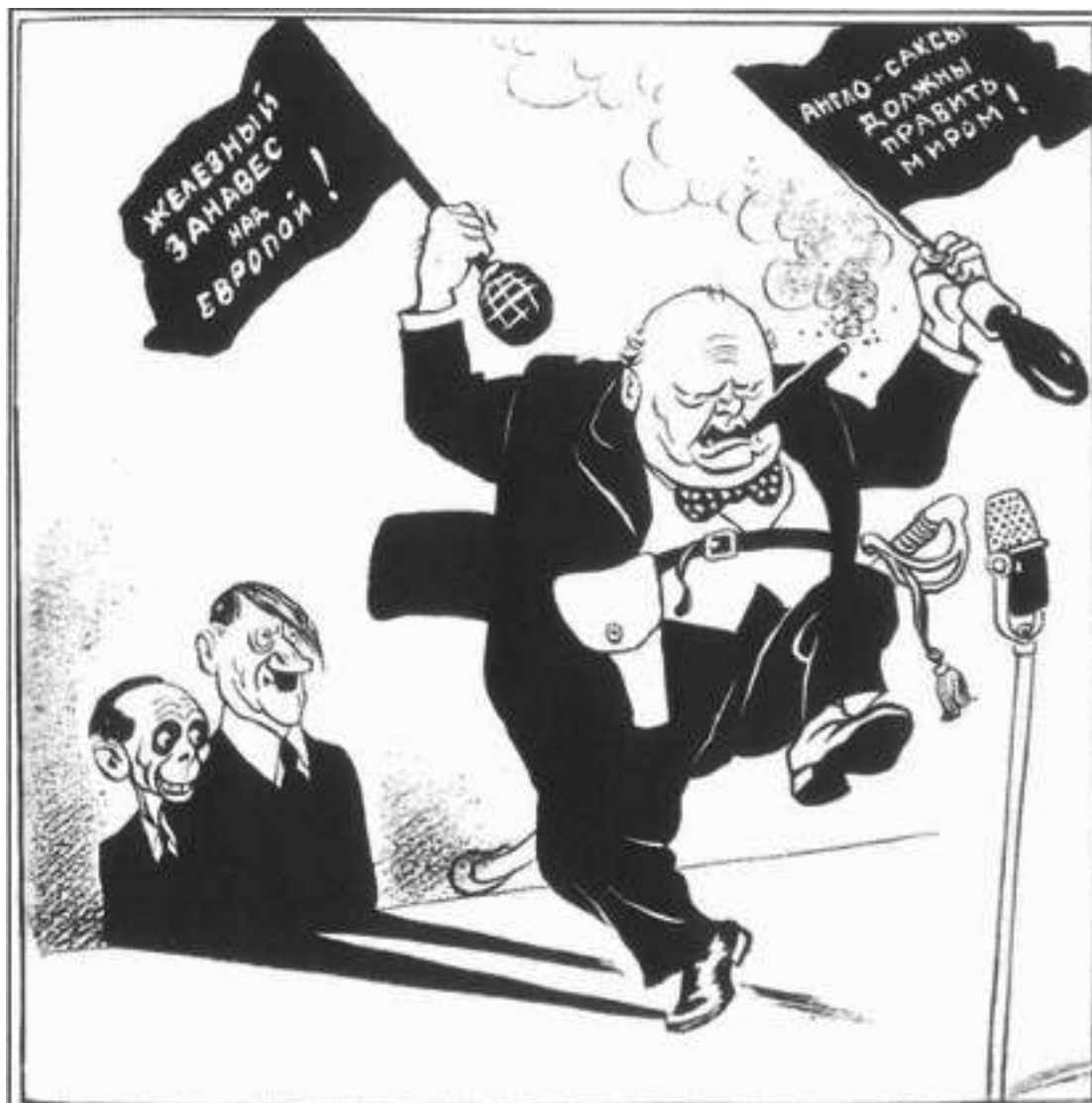
A cartoon entitled 'Churchill and His Predecessors' published in a Soviet magazine, March 1946. The flags read 'Iron Curtain Over Europe' and 'The English Should Rule the World.'