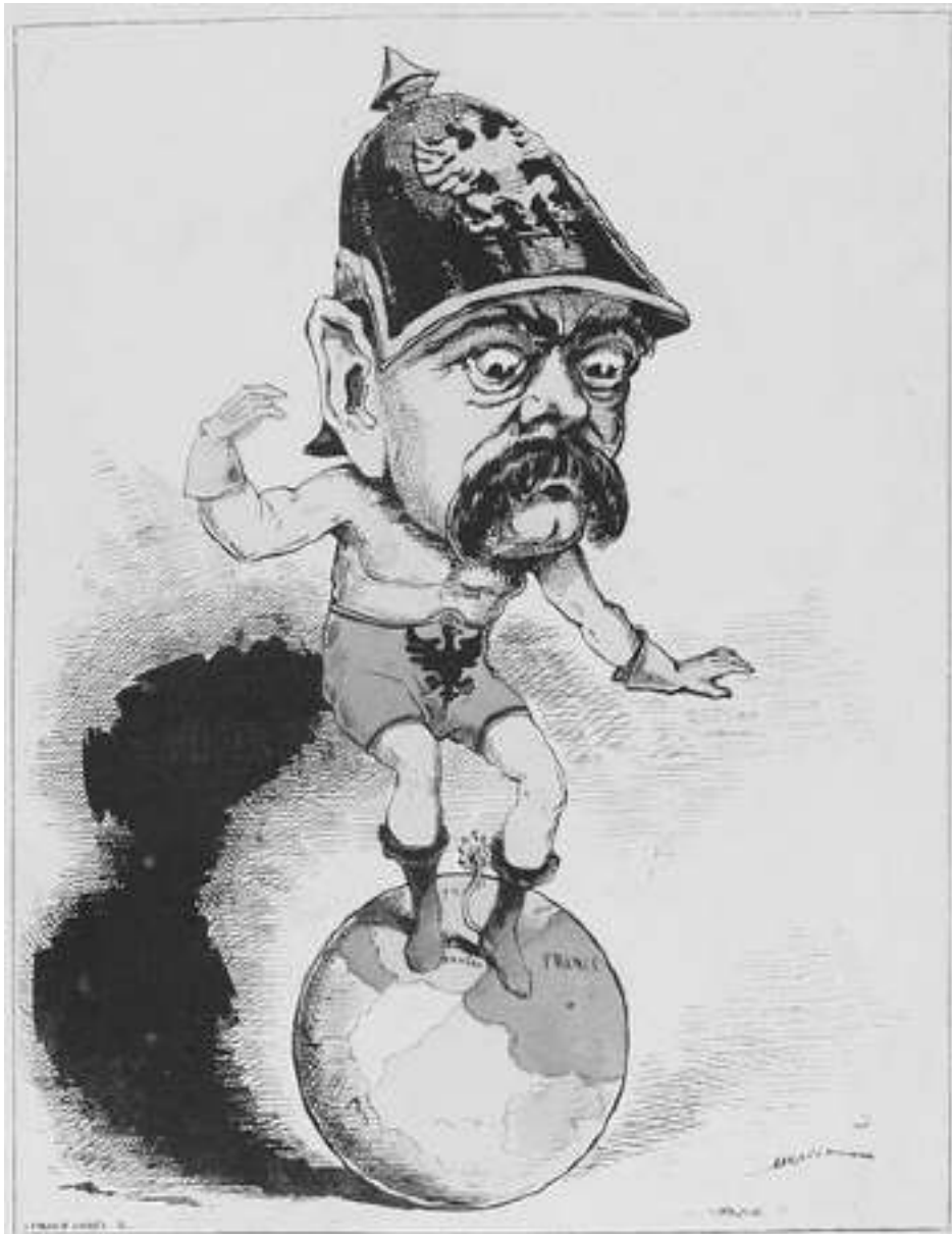
A cartoon published in France, 1870. The title of the cartoon is 'The Man on the Ball'. Bismarck's left foot is on France.