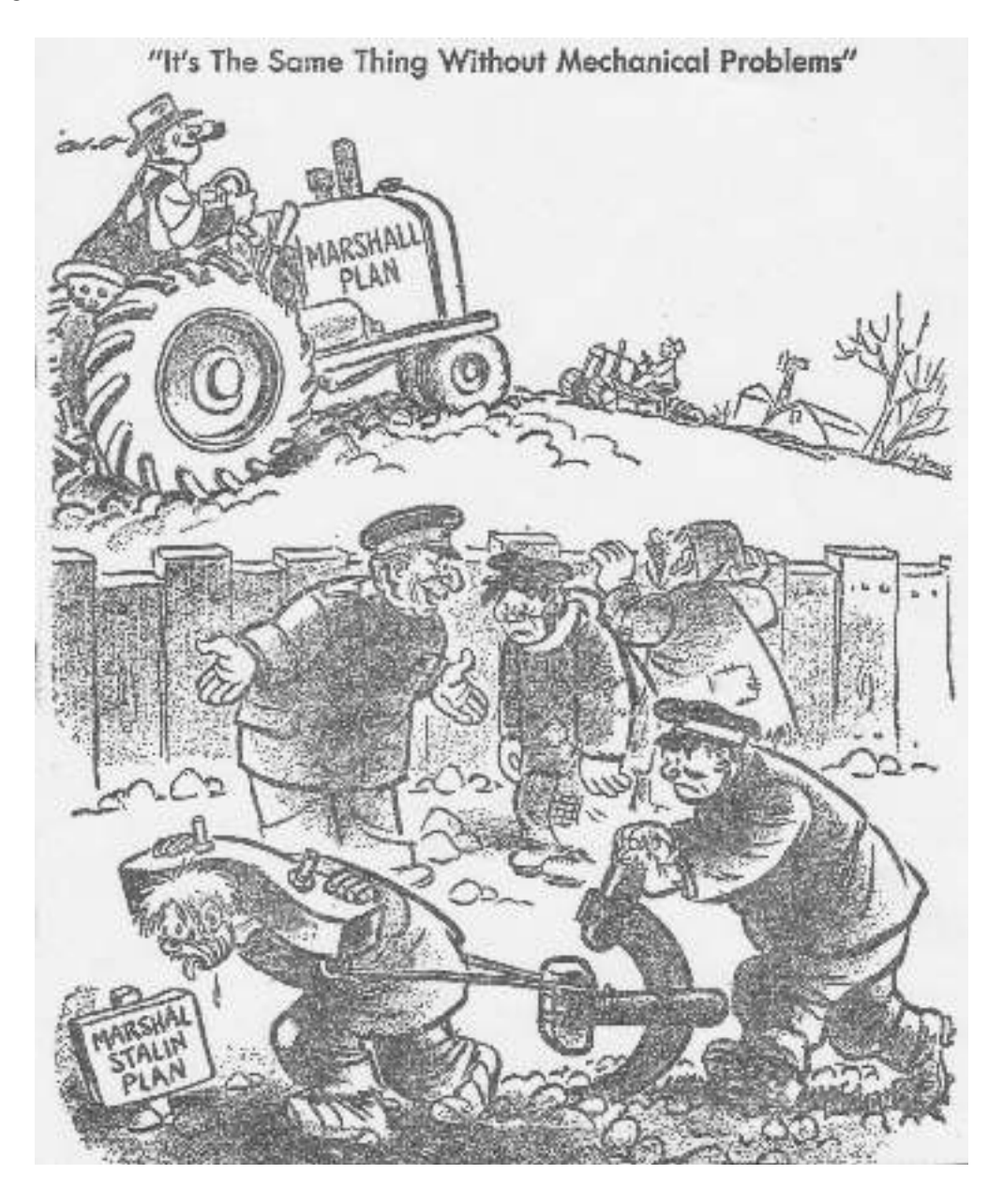
A cartoon published in the USA, January 1949.