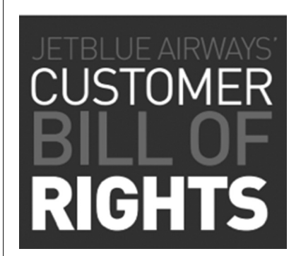
Fig. 3 for Question 3

JetBlue is dedicated to making every part of your experience as simple and pleasant as possible. Unfortunately, there are times when things do not go as planned. If you are inconvenienced as a result, we think it is important that you know exactly what you can expect from us. That's why we created our Customer Bill of Rights. These Rights will always be subject to the highest level of safety and security for our customers and crew members.