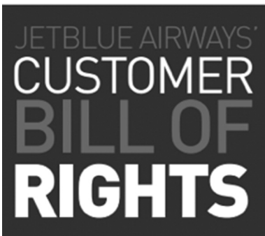
Fig. 3 for Question 3

JetBlue is dedicated to making every part of your experience as simple and pleasant as possible. Unfortunately, there are times when things do not go as planned. If you are inconvenienced as a result, we think it is important that you know exactly what you can expect from us. That's why we created our Customer Bill of Rights. These Rights will always be subject to the highest level of safety and security for our customers and crew members.