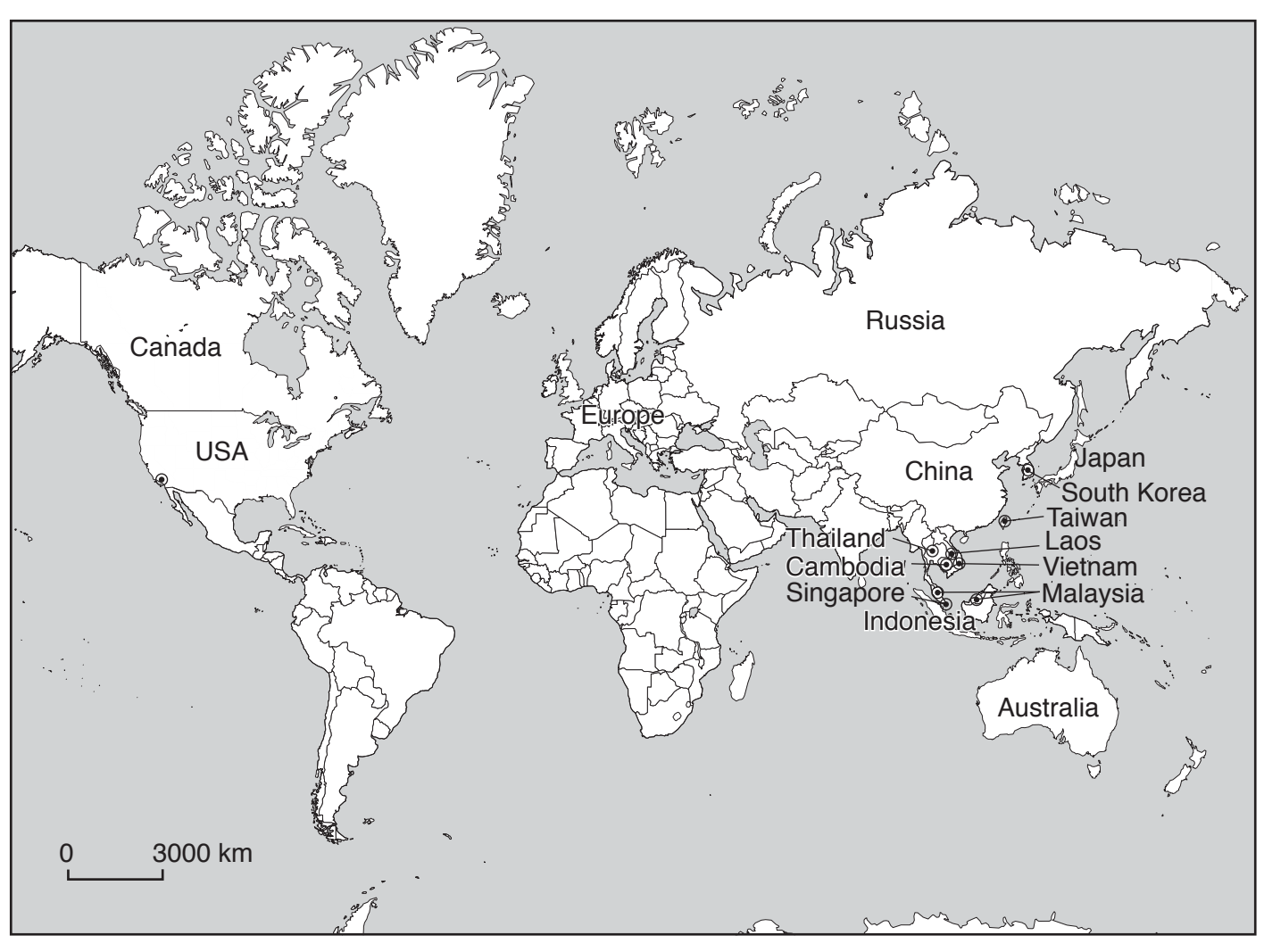
Fig. 1 Map for Fig. 1