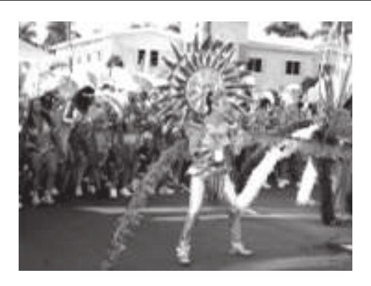
Fig. 2 for Question 2