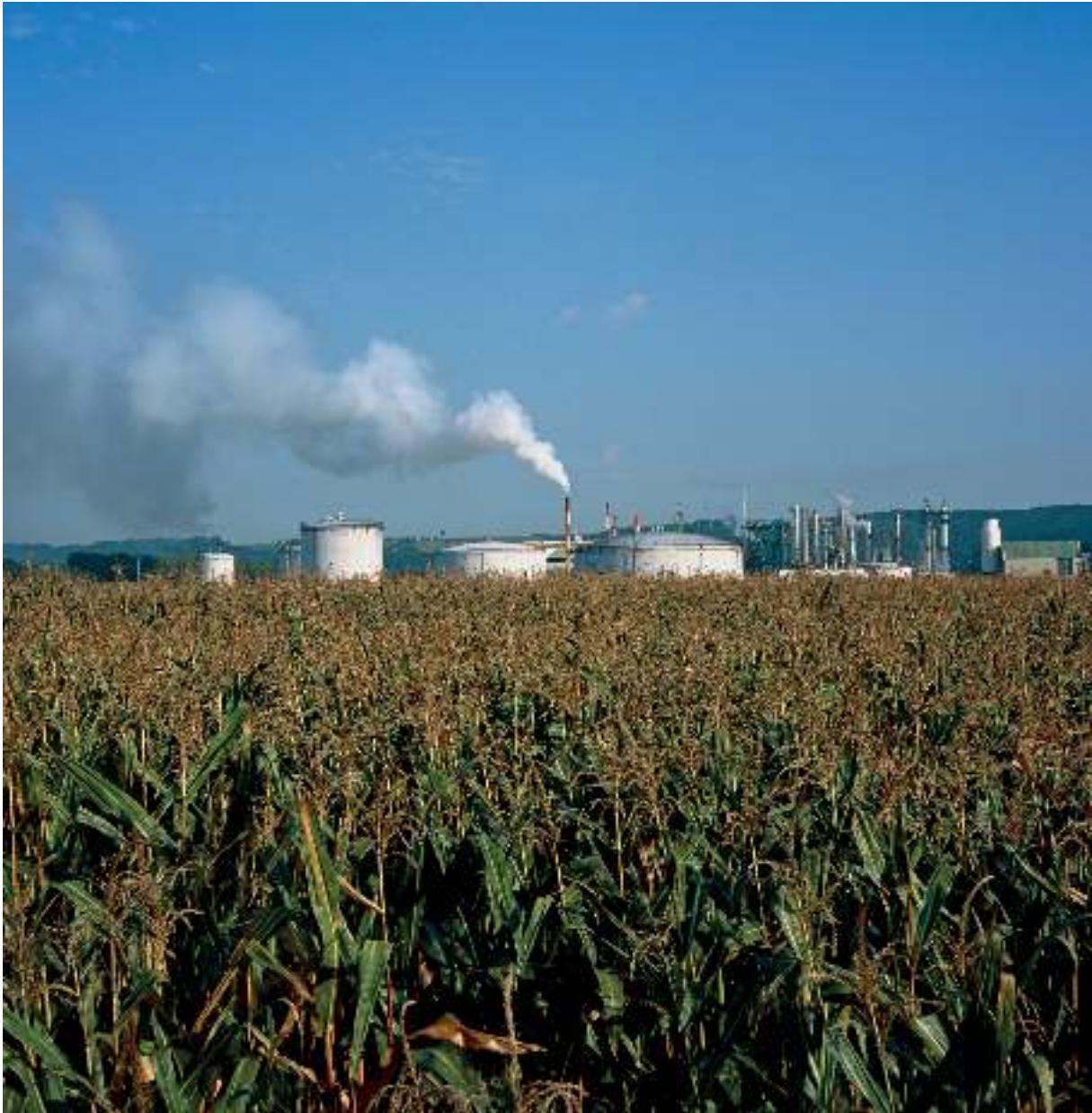
A maize field and a biofuel refinery in France, an MEDC in Europe