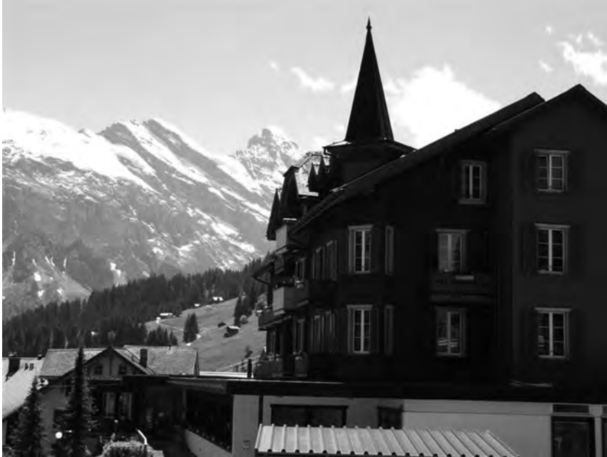
Fig. 3 for Question 2

This hotel in Mürren has 29 rooms and 3 apartments and accommodates up to 60 people. The hotel is non-smoking and pets are welcome. There is a restaurant, a hotel bar and a large sun deck where entertainments (après-ski) are offered in winter. Hotel guests are offered a breakfast buffet and a set evening meal in the restaurant.