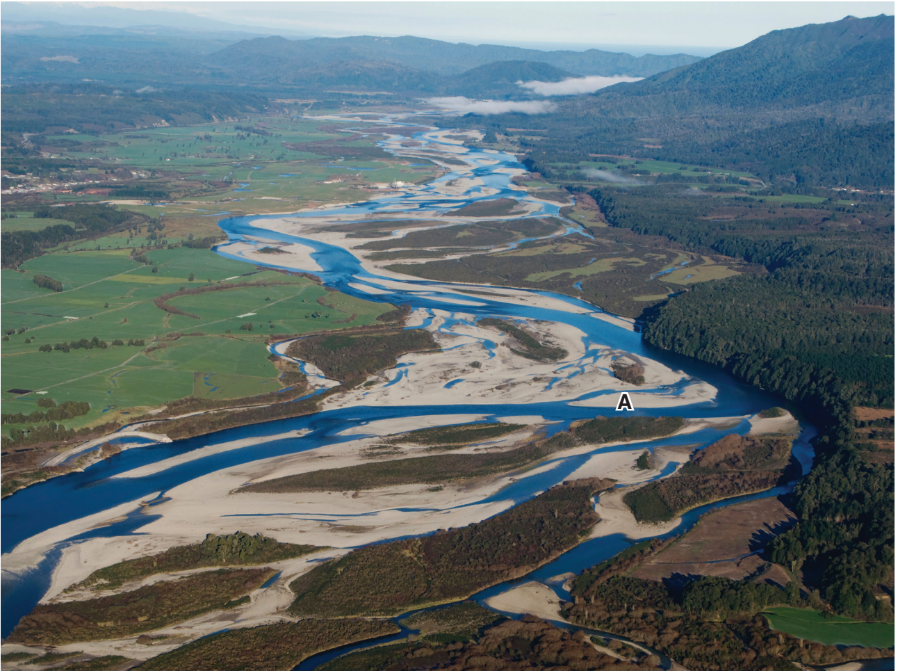
A braided river channel in South Island, New Zealand