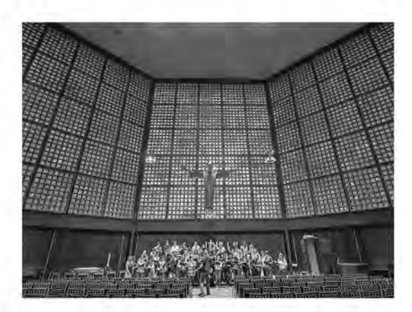
Kaiser-Wilhelm-Gedächtniskirche am Breitscheidplatz

Teilnehmer von 100 Religionsgemeinschaften in Berlin