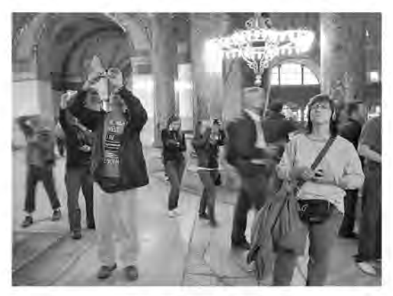
Besucher in der Berliner Moschee