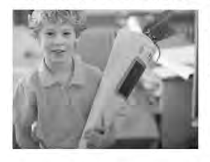
Eine alte Tradition zum Schulbeginn: die Schultüte

Im Alter von 6-7 Jahren kommen Kinder in Deutschland, Österreich und der Schweiz in die Schule.