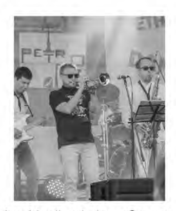
Live-Musik mit Jazz-Gruppen