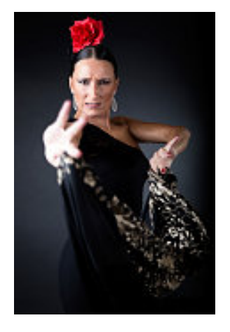
El flamenco andaluz es intenso y apasionado. El flamenco puro se baila solo.