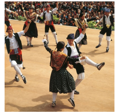
La jota aragonesa se baila con las manos en alto, acompañada de canciones.